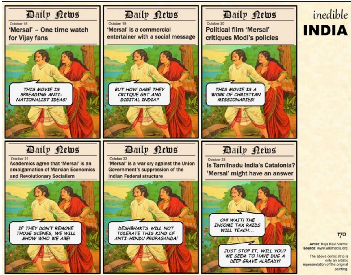
Figure 3. 28