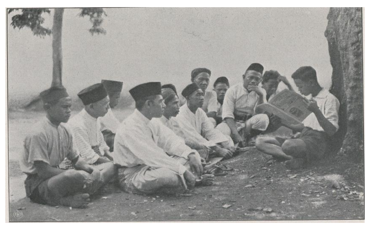
Figure 3. Public reading. This photo, taken from Balai Pustaka's propaganda book, shows a schoolboy reading to his parents and neighbors.

Although Sinar Hindia was initiated by an educated segment of both priyayi and kromo classes, it was by no means only distributed among the educated Indonesians. Given that by 1920 only between 4% and 12% of indigenous men and between 0.1% and 1.8% of indigenous women in Java could read and write (Cribb, 2000), how did SH/Api manage to play an important role in a popular movement? The key was in the practices of public reading. SH/Api was not primarily consumed in private, but rather in public events such as openbare vergaderingen (public meetings). Public reading, however, was not the invention of the early communist movement, but rather a common practice at the time.