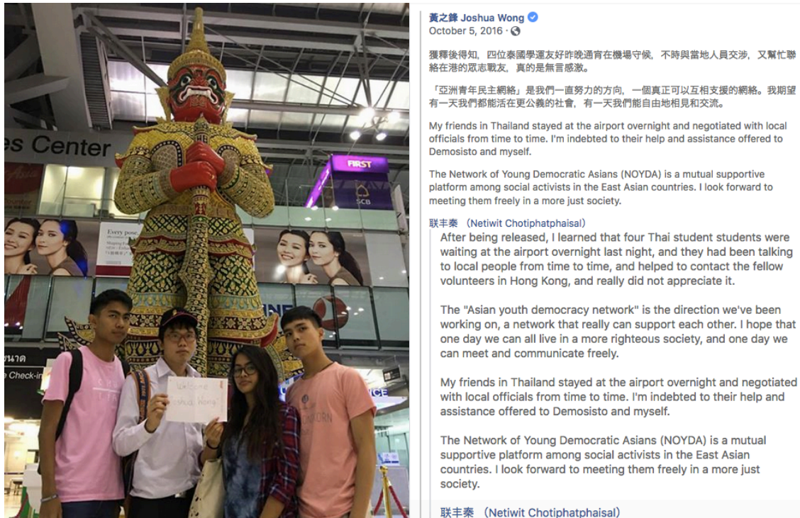
Figure 5. Joshua Wong's 2016 Facebook post features the photo of his Thai allies and the announcement of the student network.

Thailand, and Vietnam, provides support for their struggle for “the universal values of freedom and democracy” (Kwok, 2016, para. 20).