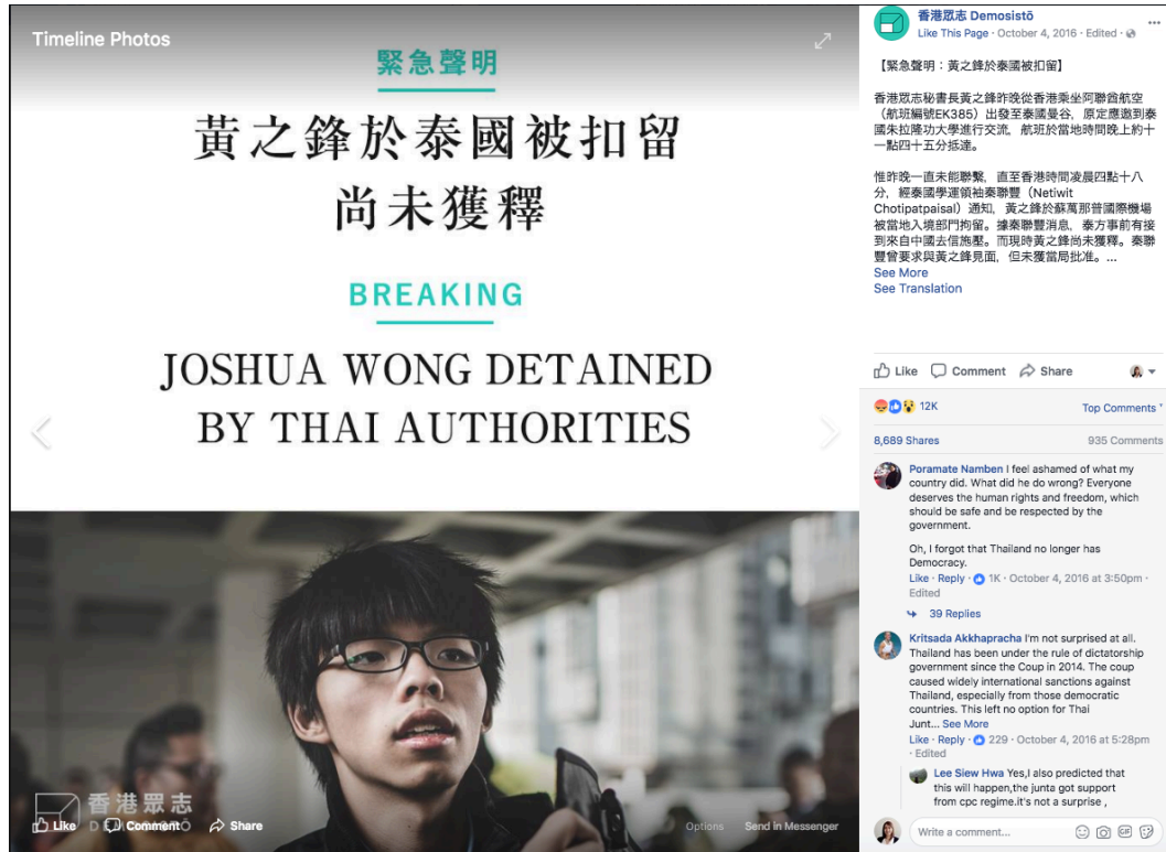
Figure 2. Demosisto Party's Facebook meme broke the news on Joshua Wong's detention in Thailand. From Cell Phone Screens to Public Screens

Castells argued in 2001 that the Internet is a communication medium that allows "for the first time, the communication of many to many, in chosen time, on a global scale" (p. 2). Today, social media applications with live broadcast capability once reserved for television stations allow individuals to directly communicate in real time on a global scale. This bypasses the reliance on gatekeepers at major news stations. Fearing that the Thai government might turn over Wong to the Chinese government, Chotiphapthaisal and Wong's friend Nathan Law took advantage of available live broadcast technology from their cell phone screens to public screens, disseminating their statements and amplifying the news about Wong's absence to galvanize support for the call for his release.