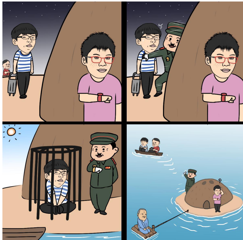
Figure 4. Popular political cartoon Kai Maew depicts Wong's arrest and deportation (Kai Maew Political Cartoon Facebook, 2016).