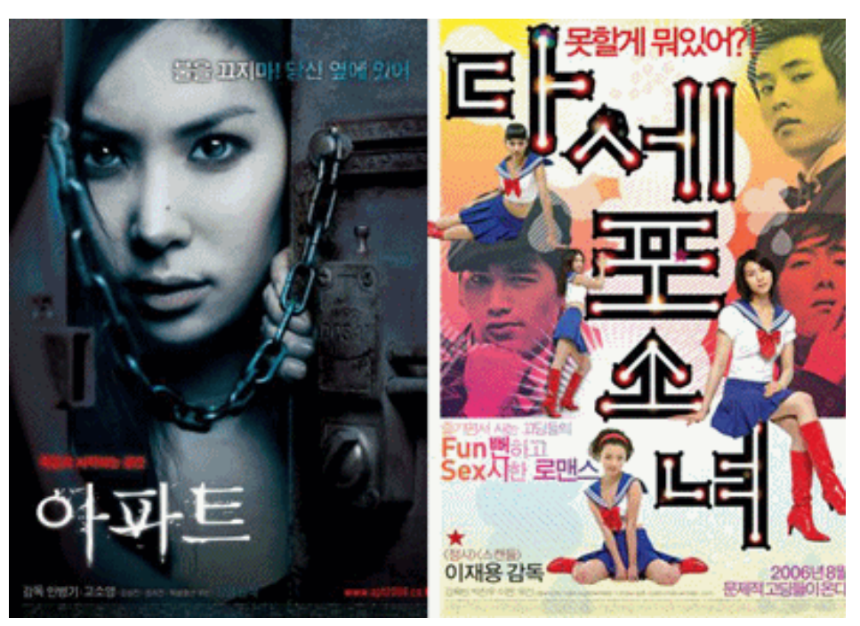
Figure 1. Posters Apt and Dasepo Naughty Girls (see Im [2013] from http://ppss.kr/archives/10755).