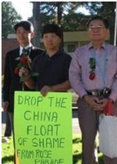
Figure 1. Human rights activists advocating removal of the float from the Rose Parade.