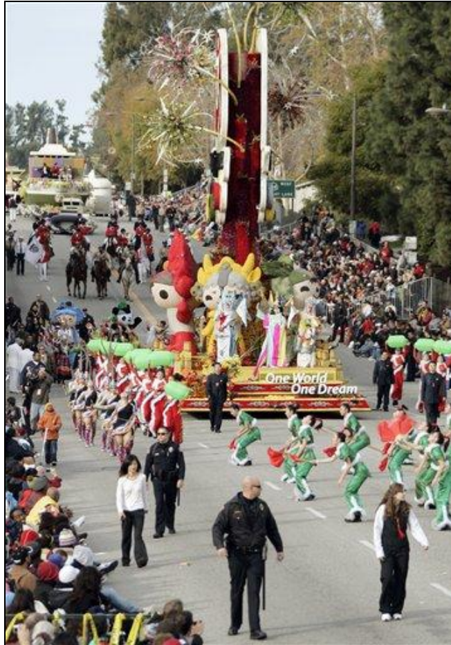
Figure 4: The Beijing Olympics float in the Pasadena Rose Parade, Jan. 1, 2008.