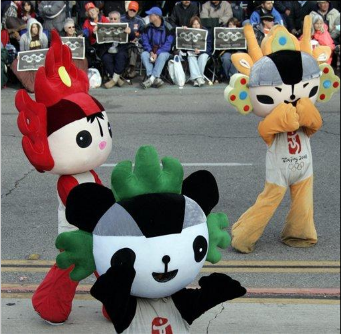
Figure 5. Beijing Olympic mascots accompanying the float pass protesters in Pasadena Rose Parade, Jan. 1, 2008.