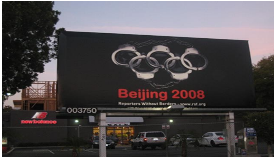
Figure 3. The Olympic five rings as handcuffs.