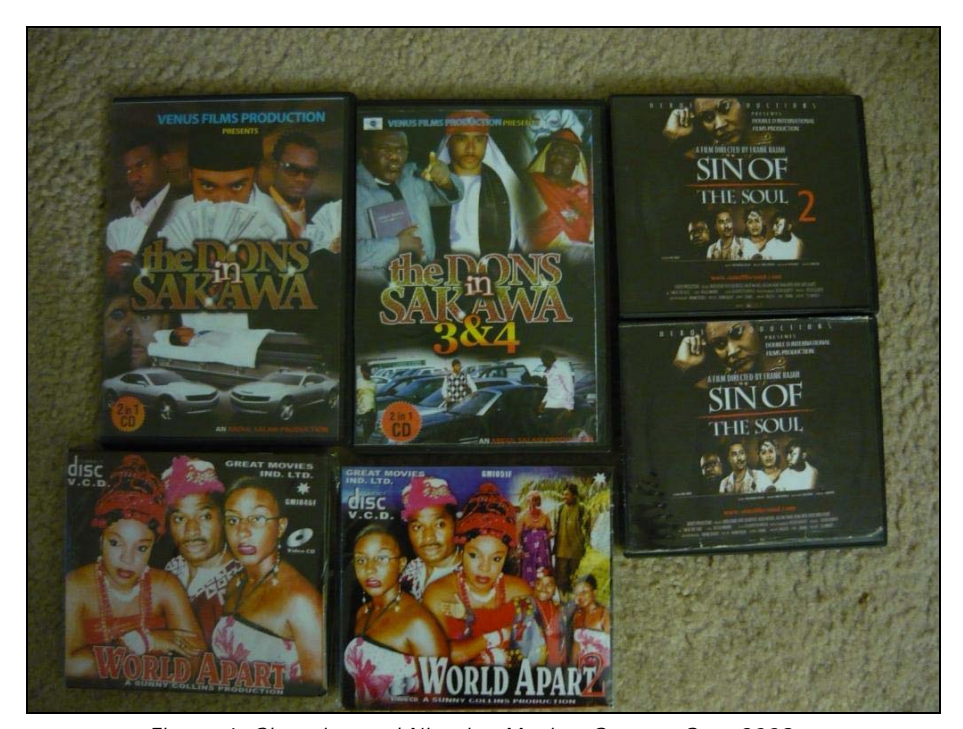
Figure 4. Ghanaian and Nigerian Movies.

untrained) producers, both young and old, and from diverse backgrounds, when VHS recorders became widely available. Combined with liberalization of the media, this gave producers both the technology to produce low-budget movies and broadened outlets for their products. The market became even more attractive as more and more Ghanaians were able to afford personal video players. The industry now produces more than 50 English-language and vernacular movies a year, covering a variety of genresrags to riches, Pentecostalism, occult, horror, comedy, and epic (Okome, 2007; Omoera, 2009; Wendl, 2007). Nigeria is currently the regional leader in the industry, producing tenfold the quantity of movies coming out of Ghana. Still, with growing Nigeria-Ghana collaboration and the expansion of the Ghanaian movie industry, the term "African movies" has come to be synonymous with low-budget video movies from Nigeria and Ghana (Omoera, 2009).