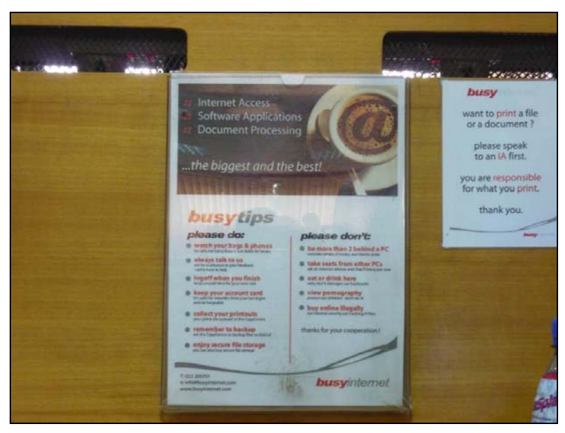
Figure 3. Internet Café Signs Warn Against "419" Activities.

Known locally as sakawa or "419" (see Figure 3), cyber fraud is a particularly problematic phenomenon that now has Ghana ranked as number two in notoriety (after Nigeria), and several North American merchants block e-commerce transactions from Ghana (Harvey, 2009; Kwablah, 2009; Nelson, 2009). Scams include making online purchases with stolen credit cards, conducting online dating scams, and inviting contacts to participate in supposedly mutually beneficial money transfers. Internet dating scams have become so prevalent that user help sites, such as DelphiFAQ.com<sup>13</sup> and the eHarmony blog (eHarmony.com, n.d.), have emerged all over the Internet. The U.S. Embassy in Ghana reportedly receives up to 15 calls a week from American victims of online dating scams (Morse, 2006).