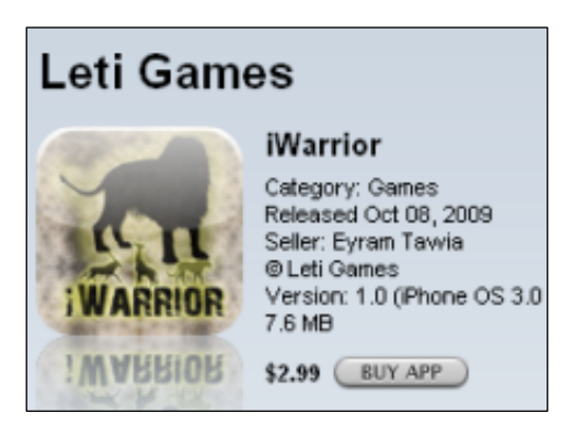
Figure 5. iWarrior mobile phone game in iTunes App Store.