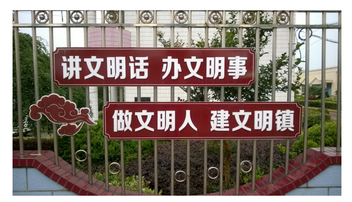
Figure 1. "Speak wenming words, do wenming things, be a wenming person, build a wenming town." Slogans promoting wenming [civility] on the walls of a high school in the Shanghai countryside. Photo by the author, June 2016.