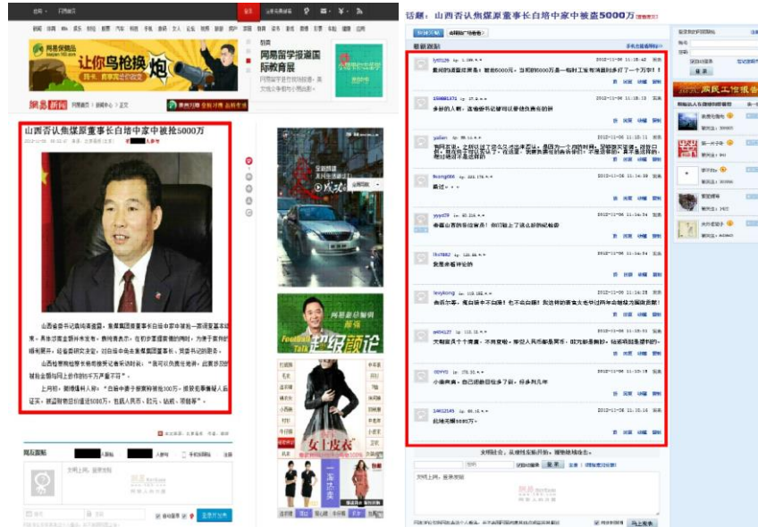
Figure 2. The layout of the stimuli. The stimuli were placed inside red frames. Other content on the news (left) and comments (right) pages was the same across conditions.