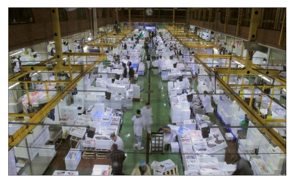
Figure 11. Time-lapse photography project on London's Billingsgate Fish Market. Dawn Lyon, faced with the difficulty of apprehending the sensory environment of this market through observation in real time, used time-lapse photography (every hour of activity is presented in 30 seconds) as an analytical tool for researching the elusive quality of a market space and the work that takes place within it. This approach generates insights into temporal and spatial rhythms, patterns, and interconnections of work and consumption, and the ways in which embodied labor, interaction, and mobility produce market space.

pictures that documents any visible changes that have occurred in the depicted scene (for an early example, see Rothman, 1964). "Time-lapse photography," then, is a form of interval photography whereby the sequentially produced photographs represent a visual succession within a duration of time, giving the impression of a continuous record (a sort of film in "fast motion" or stop-motion) so that slowly progressing changes or activities spread over many hours become "visible" in a fluid form (e.g., useful to perform a rhythm analysis of the human interactions on a square, a market (Figure 11), or a train station). In a way, interval photography and time-lapse photography are forms of "repeat photography" (Rieger, 2011). Interval photography, however, usually does not involve revisiting the site, "retracing," and reproducing the initial framing and conditions of the scene, as data are being collected at a given (fairly limited) period of time, most often without removing the camera from its fixed (tripod-mounted) position.