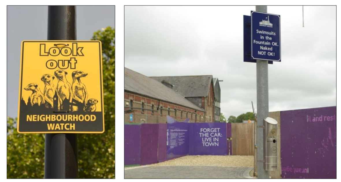
Figure 5. (Left) London Neighborhood Watch sign.

context of cause and effect) and on the information one wants to extract from them (the specific research interest).