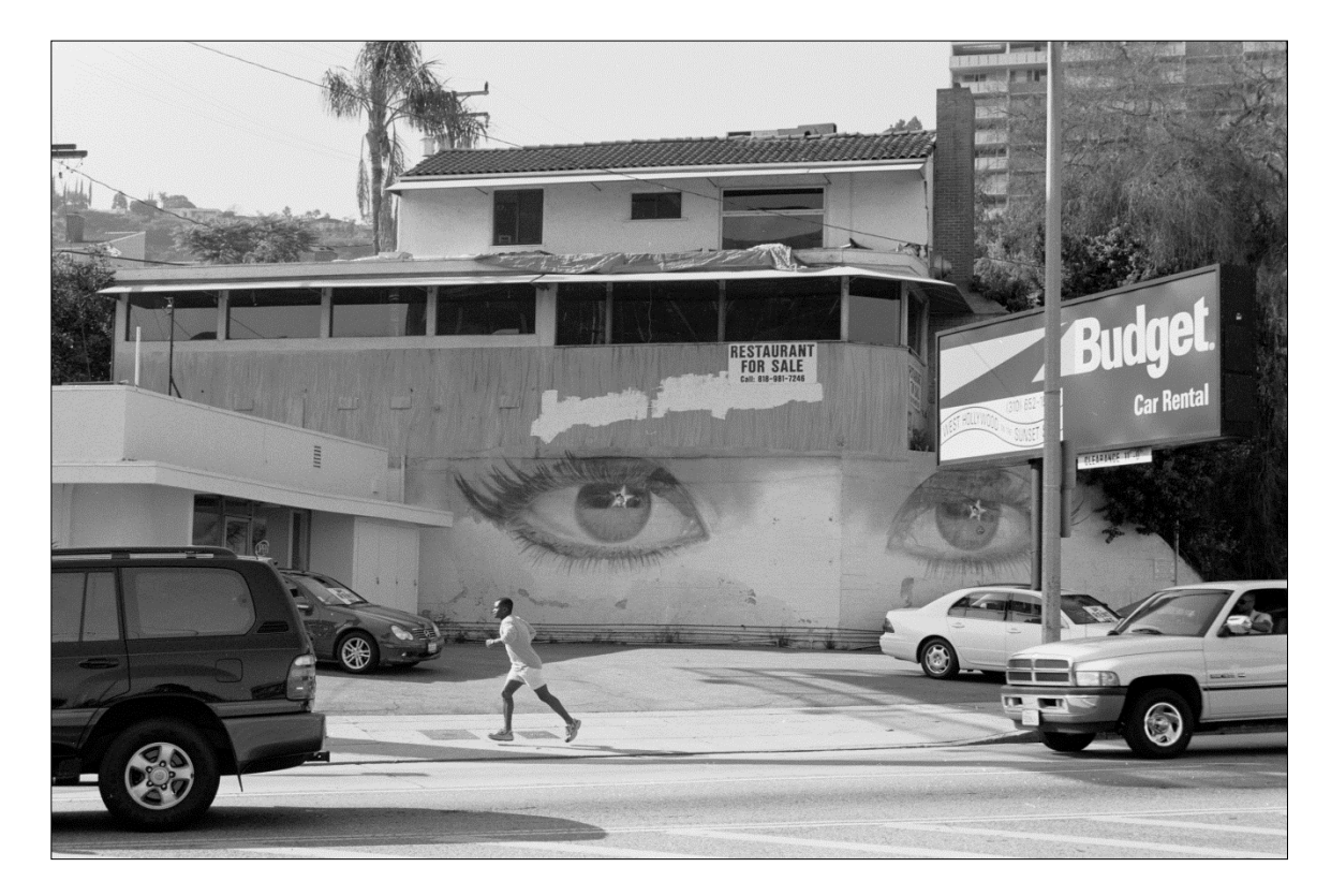
Figure 18. Picture originally titled "The Urban Panopticon/Los Angeles," taken from "Street Discourse: A Visual Essay on Urban Signification" (Pauwels, 2009). This photo essay attempts to interrogate and confront the multi-authored communicative spaces of cities through a combination of evocative texts and purposefully made pictures from actual aspects of urban material culture and human behavior. Both the textual and the visual parts of this essay conjure a view on the city as an extremely hybrid semiotic space—a huge, out-of-control combination of interventions made by actors, with different, often conflicting interests. The visual essay implicitly and metaphorically examines these multiple intermeshing discoursesthe historic, the political, the social, the communicative, the multicultural, the commercial, the religious, and so forth—which provide the city with its unpredictable, multilayered, and never fully graspable character.

The images of a visual essay are often made with this final "communicative" purpose in mind, so that they will be more apt to fulfill their expressive role, both through what they depict (subject matter) and how they depict it (formal traits). The same applies to the practice of scientific filmmaking, which typically conflates the distinction between the production of visual data and the final organization of the material into an audiovisual whole. Neither is a pure end format or a distinct research method.