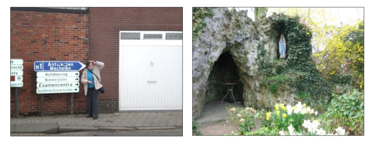
Figure 16. (Left) Student Alina Dragan asked respondents suffering from an acquired brain injury to depict crucial aspects of their life. They often expressed their confusion and insecurity when trying to navigate the city through several pictures depicting street signs and people reading maps. Other pictures referred to their need for a quiet and safe environment.

to note is the fact that the visual outcome of a respondent-generated imagery project—even when resulting in a complete film or photo series—is not a scientific end product (but primary "data"). Researchers who work with such materials are left with the difficult task of meticulously analyzing such images for both significant content and style, as cultural patterns may reside in both (see also Chalfen, 2011).