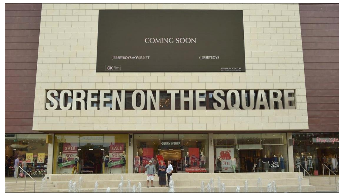
Figure 21. Outdoor screen at a recently revamped square in Dorchester. Cities are becoming more explicitly "communicative" through the use of screens and the use of a host of (visual) technologies that "mediate" the urban experience in many ways.

connected and together "produce" the city and life within the city in radical but as yet hardly documented new ways. The city is replete with screens and media of all sorts (Figure 21). City dwellers and visitors are using personal media while navigating the city, and the city is virtually and visually marketed and reframed by numerous official and private actors with distinct or overlapping political, cultural, or social agendas (Graham, 2004; McQuire, 2008).