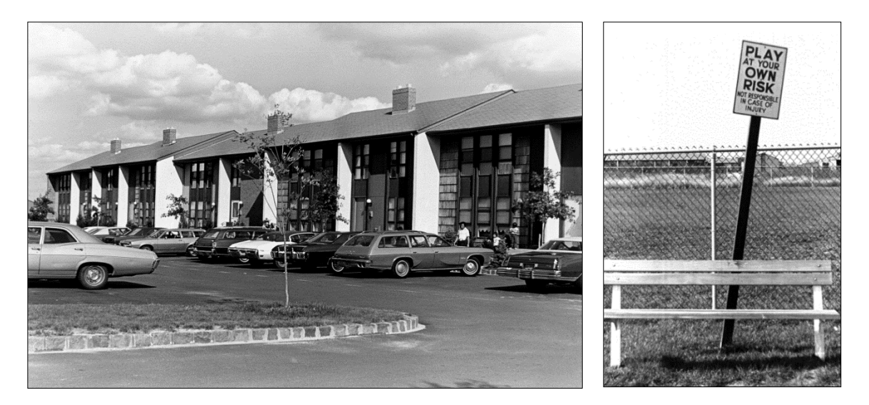
Figure 14. (Left) Twin Rivers Visual Stimulus #5.

Figure 15. (Right) Twin Rivers Visual Stimulus #13. Jon Wagner used the photo-elicitation approach as part of a larger study about the physical and social features of Twin Rivers (see Keller, 1976), a planned housing development project located about an hour from New York City. The two images belong to a series of 17 photographs, depicting different aspects of the newly "constructed" community. This set of visual stimuli was used "to explore resident perceptions of this community in-the-process-of-becoming" (Wagner, 1979, p. 87). This included both their familiarity with aspects of the prefabricated environment and individual preferences and needs. Wagner (1979) sees photo elicitation as a powerful "vehicle for asking these questions without suggesting response categories" (p. 86).