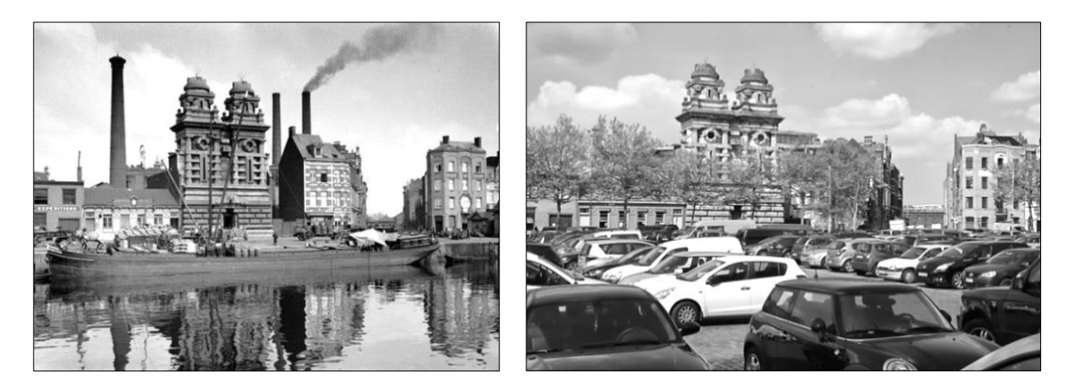
Figure 12. (Left) Antwerp Southern Docks (undated, first half of 20th century).

Rephotographers must realize that they are working with highly "mediated" aspects of a presumed social reality and that, to some extent, they are revisiting "views" that are tied to initial choices made in the past (e.g., picture postcards of tourist attractions from a particular vantage point). Another challenge for rephotography as a long-term endeavor is that research subjects may disappear or become inaccessible or invisible. Structures may become broken down or hidden from view by a newly erected structure. Events may cease to exist. Participants may die, move away, or refuse to cooperate any further. Sites may have shifted from public to private ownership, or vantage points may be inaccessible because of changes in traffic situations, for example, trees that have grown bigger, and so on.