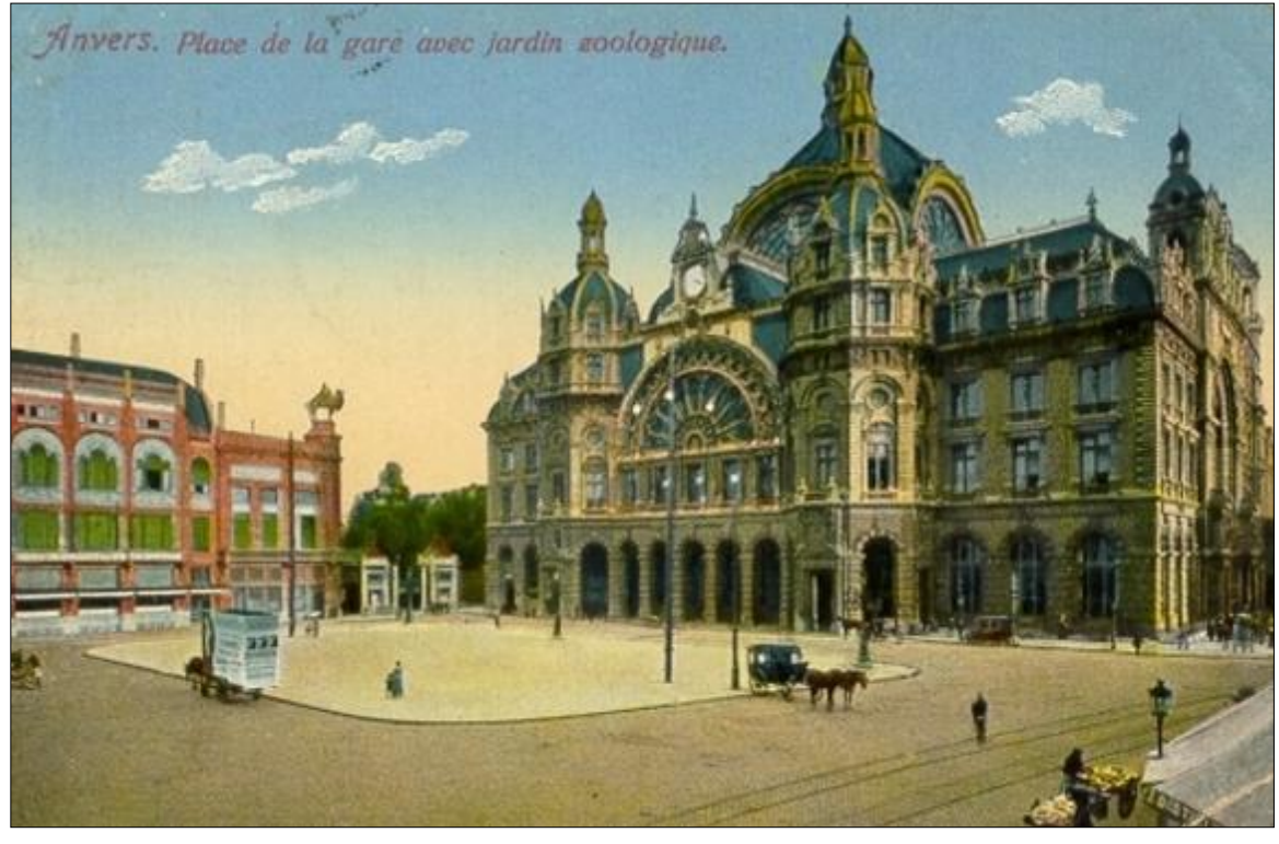
Figure 1. Postcard of Antwerp Central Station, the Queen Astrid Square and the Zoological Garden. Picture postcards, for a long time, were the only more or less systematic and publicly available repositories of "street views," although often limited to "attractive" or "historically important" sights.

traversing different cultures, and from times long passed to the nearly immediate present. Often this material is able to provide a unique "insiders' view" (in homes, institutions, neighborhoods, etc.). Having not been produced for the particular research use for which they later serve, such materials are, at least in this respect, "nonreactive" records, although of course they often should be considered as "performances" of some kind and for some purpose (cf. family snapshots; Chalfen, 1987; Musello, 1979; Pauwels, 2008a).