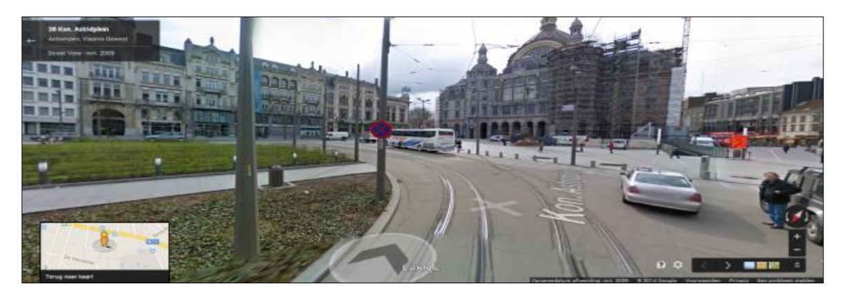
Figure 3. Google Street View image of Antwerp's Central Station and Queen Astrid Square. Currently, researchers may study the visual dimensions of cities, both from an aerial and street-level view using preexisting and regularly updated visual repositories such as Google Earth. These images can be used as a tool to "map and survey" an urban area prior to a ground-level visit by the researcher. The researcher, however, must take into account that there may be a considerable time lag between the recorded images and the present state of the depicted site, as well as among the visual materials with which Google Earth is created.