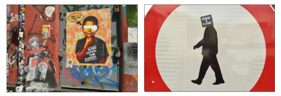
Figure 7. (Left) Wall in Brick Lane, London.

Figure 6. (Right) City renewal Dorchester. "Explorative" researcher-produced images of urban communication strategies for informing and disciplining the urban dweller.