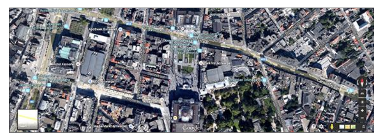
Figure 2. Satellite image of Antwerp's Central Station area.

appearances, for example, through well-placed informants and a variety of other sources of cultural, historical, and technical information, but it is seldom an easy task. Once collected and organized, the researchers face the difficult task of making sense of the visual materials in relation to their specific research interests. The primary purpose of a social scientific visual analysis is to discover significant patterns in the depicted (the "what") and manner of depiction (the "how") in order to subsequently develop plausible interpretations that link observations to past or current social processes and normative structures.