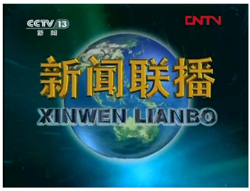
Figure 4. The program logo of CCTV's news simulcast, CCTV's News Simulcast, January 13, 2012.

After the music visual, two news presenters appear on the screen, sitting behind the desk. Possibly due to the pressure of the audience rating, the presenters tend to create an informal and friendly atmosphere to engage the audience by wearing smiles on their faces. But their smiles look intentionally posed instead of naturally expressed (see Figure 5).