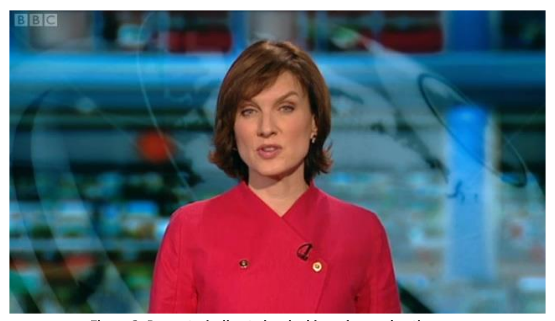
Figure 2. Presenter's direct visual address in opening the news headline, BBC News at Ten, January13, 2012.

The overall presentational structure of BBC News at Ten can be summarized as follows: opening as headlines + music visual sign-in/greeting + news items (1-n) + coming up headline + news items (1-n) + closing. This program begins with a heavy drumbeat and a piece of urgent, rhythmic background music, during which a presenter appears on the screen in a medium close-up shot and carries out a direct visual address, as if communicating face to face with the audience (see Figure 2). After the drumbeat, the presenter starts to deliver news headlines, with voices over the news footage, each separated by another drumbeat, thus creating "a sense of urgency and . . . a declaration of immediacy for the newscaster's larger claim to authoritativeness" (Allan, 2010, p. 114).