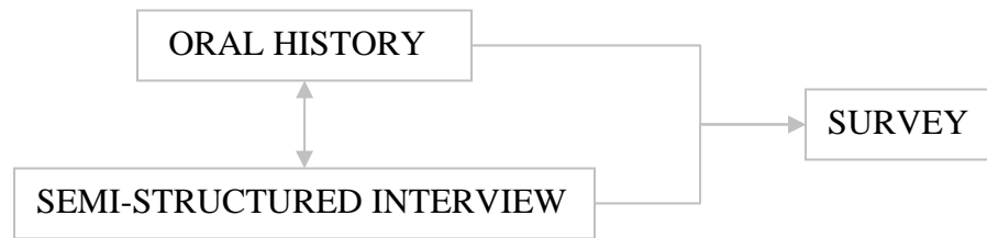
Figure 2: Core set of methods for on the ground research.

This process may seem laborious for those who are looking for quick responses to problems that require urgent solutions, but it has proved critical in a conflict environment like Darfur for at least two reasons: