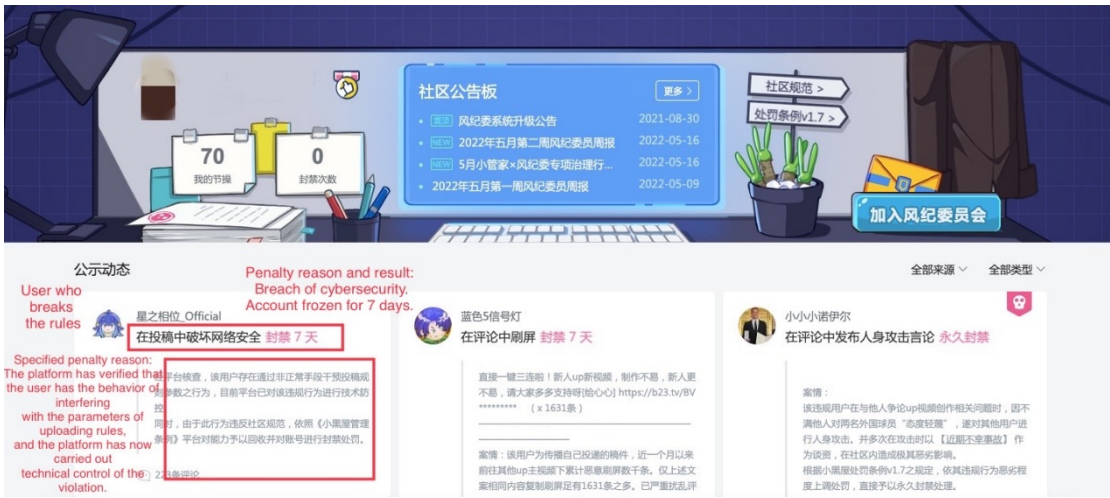
Figure 6. Screenshot of the "little black room" on Bilibili (Bilibili, 2017).

who apply to become a member of the committee must show a high level of participation in the community and have no record of violations in the last 90 days, and as per the terms can function as members for a 30-day term at a time. Each member can vote 20 cases maximum each day, and each case has a voting period of 30 minutes. If more than 60% of the voters see the content violates the rules, the user is subject to penalties, ranging from their account being temporarily frozen for a few days to its permanent ban, depending on the severity of the violation. The account that disseminates false or inaccurate information will be permanently closed after three occurrences of violations. If more than 60% of the voters do not see the content as a violation of the rules, no action will be taken. When the votes of both for and against do not exceed 60% of the total, the case will be voted again. The members vote on each reported case based on the detailed committee guidelines (Bilibili, 2018) and the penalty regulations (Bilibili, 2017). Users who break the rules are listed in the "little black room" (小黑屋), as shown in Figure 6. The "little black room" displays not only their account names but also the detailed reasons for penalties and their corresponding penalty results, which increases the transparency of the process of participatory surveillance.