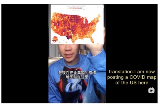
Figure 7. Screenshot of the latest map of COVID-19 cases in the United States (Li Sanjin Alex, 2020, 00:27).