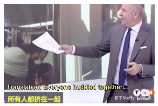
Figure 8. Video clip of local TV news broadcast in Milan (Yingzi Steffy, 2020, 00:46).