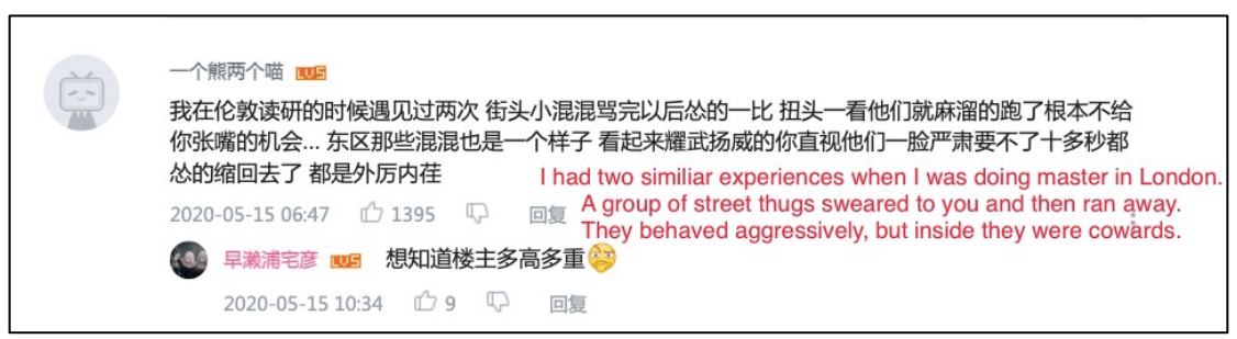
Figure 11. Users' comments under Video 3 (Yigexionglianggemiao, 2020).

(i.e., in a specific time) and personal (i.e., authentic personal experience) content tends to be more persuasive and trustworthy (Kang, 2010). This video had attracted 2,685 danmu and 3,820 comments in total by the time of this study, which indicates that the inclusion of personal stories in uploaders' videos can also facilitate user participation and thus enhance distributed trust building. We found that users tend to support and build trust with uploaders by leaving comments about their similar experiences and deep feelings (Figures 11 and 12). This affective exchange between influencers and users, as Merz (2019) notes, exhibits a deep and intense, rather than superficial, level of social interaction and thus demonstrates new possibilities for building trust in the digital age.