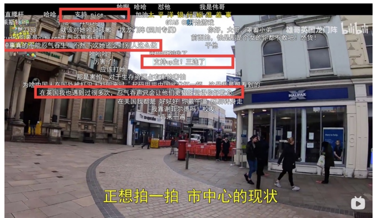
Figure 12. Users' danmu in Video 3 (Small talk about UK by Xiong Ge, 2020, 00:08). Note. Translation of some danmu: "Support you! We can't really hold back our anger and say nothing, otherwise she'll do it to other people again next time." "Support the uploader! I have 'one button three clicks!""

"I've experienced the same in the UK, and I think saying nothing only makes them more aggressive and think you are weak."