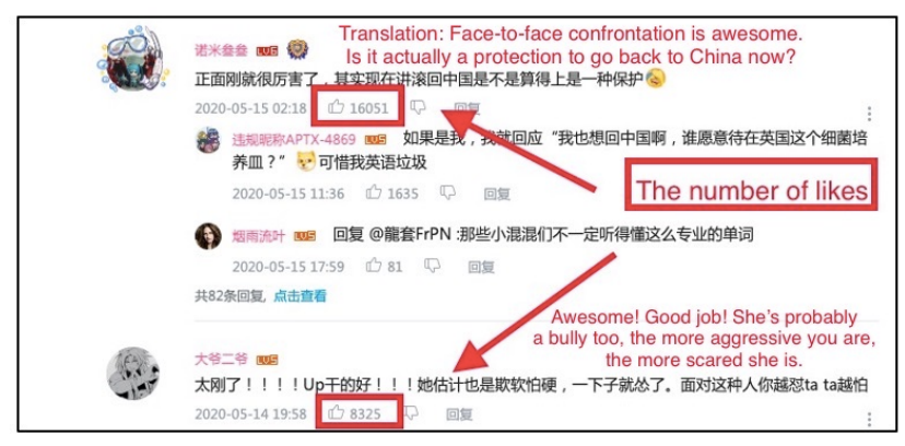
Figure 3. The comment section under Video 4 (Nuomisansan, 2020).

As social media platforms become increasingly interactive, users are now participating in the production of collective media content. Metzger and Flanagin (2008) indicate that the real value of interactivity is in giving users the opportunity to move beyond being just receivers to also being sources of information. These interactive features on Bilibili, or what Picone and associates (2019) term "small acts of engagement" (e.g., commenting, liking, sharing), enable the construction of trust among individuals, reflecting the very nature of distributed trust in the digital age (p. 2011). As our analysis demonstrates, through mutual interactions and social endorsement, a new way of building trust among individuals has been established in the digital age that greatly differs from traditional media.