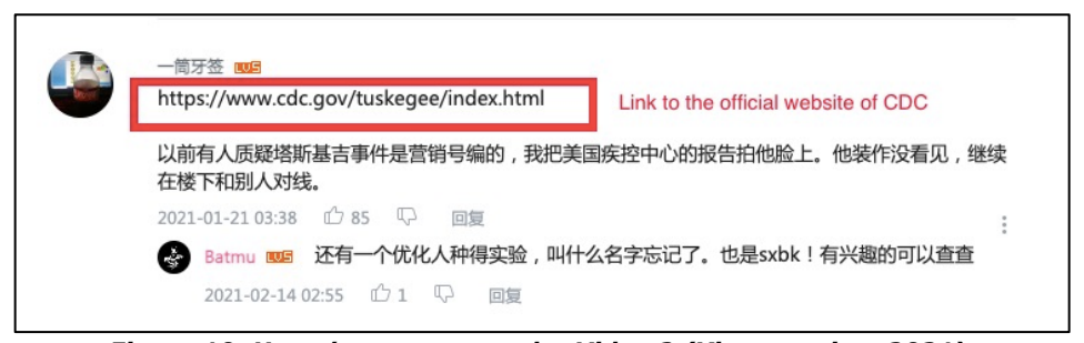
Figure 10. Users' comments under Video 2 (Yitongyaqian, 2021).

the UK includes screenshots from Camden Town and Primrose Hill Police's Twitter account (Figure 9). The facts and data, as van Dijck and Alinejad (2020) suggest, are the basis of scientific evidence because they are "the result of methodical and empirical observations" (p. 2). This inclusion of authoritative information from traditional mass media in uploaders' videos can enhance trust building because, as Metzger and associates (2003) argue, the use of high-quality and relevant evidence (e.g., up-to-date and authoritative information) is one of the key dimensions of content credibility. In addition, Fisher and colleagues (2020) also highlight the importance of localism in trust building, as survey research shows that among audiences local news tends to attract a higher level of trust than general news. As the abovementioned examples show, remixing local journalism and health information in their videos not only allows uploaders to disseminate the latest information about the global pandemic and show their audiences how other countries confront the pandemic but also improves the level of trust in their own content. This way of building trust through authoritative and local information is also found in users' comments, as shown in Figure 10.