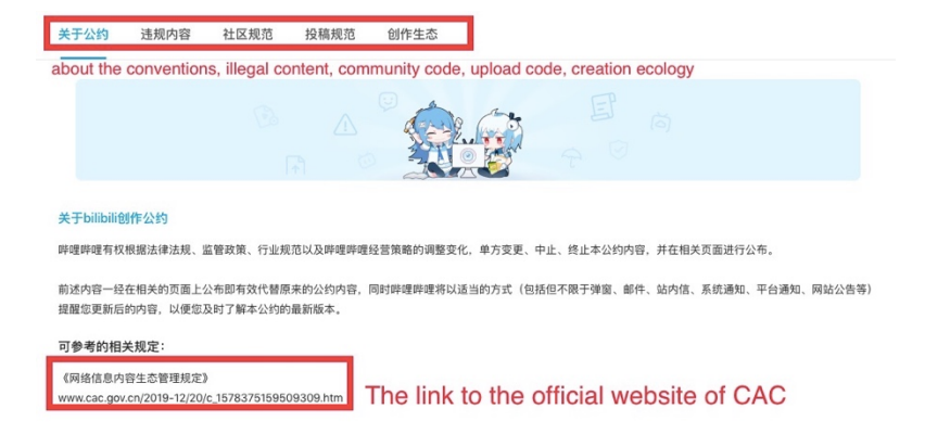
Figure 4. Screenshot of Bilibili Creation Conventions (Bilibili, 2019a).

management of the online platform itself. As can be seen, although Bilibili has been introducing its own regulatory structures on content and user behavior, it is still in a heteronomous position with regard to the state's governance. This combination of self-regulation and government regulation, as Cusumano, Gawer, and Yoffie (2021) argue, might produce better outcomes than invasive government intervention alone in the digital age.