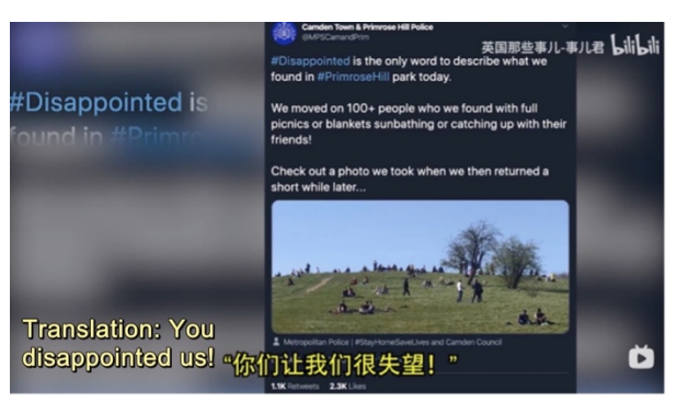
Figure 9. Screenshot of local police's tweet on Twitter in the UK (Things in the UK, 2020, 01:40).

Figures 7 to 9 show that scientific data and news information were included in the videos as evidence to increase the level of trust in their content. Video 5 by Li Sanjin Alex includes the screenshots of the latest map of COVID-19 cases (Figure 7) and daily statistics from the Centers for Disease Control and Prevention (CDC) of the United States; Video 6 by Yingzi Steffy contains video clips from a local Milan TV news broadcast (Figure 8) and screenshots from online newspaper Rai News 24; and Video 3 by Things in