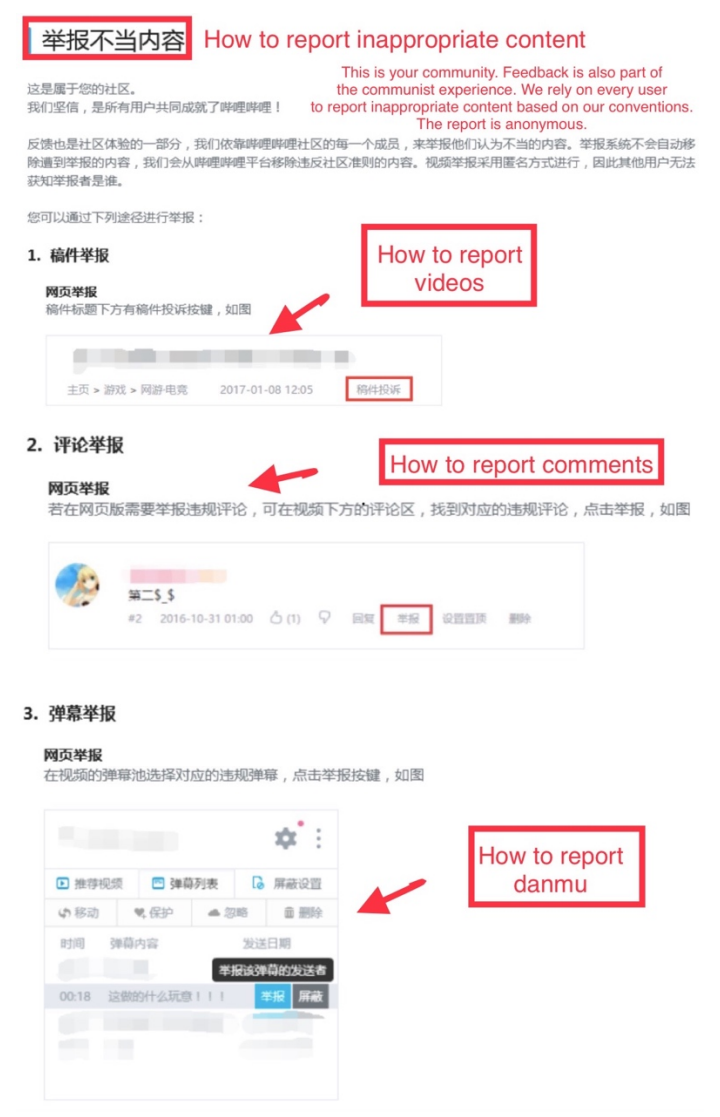
Figure 5. Screenshot of the community norms of Bilibili (Bilibili, 2019a).

responsible comments while prohibiting the publication of illegal, aggressive, vulgar, misleading, and fabricated comments. It is clear that the platform adopts this method of entrance exam to teach each user the rules of the community and to instill a sense of participatory surveillance, which can enhance the formation of trust building on the platform, from the very beginning of joining the community.