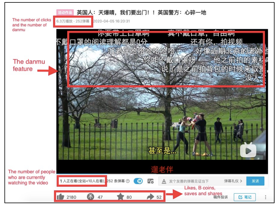
Figure 2. The video interface of Bilibili (Things in the UK, 2020).

The B coins feature is a unique affordance on Bilibili. Users can only earn coins by logging into the platform every day or by uploading videos on the platform. Unlike the monetization scheme on other social media platforms such as the YouTube Partner Program on YouTube (Kopf, 2020), B coins do not bring direct revenue to the uploaders. The feature allows its users to send coins, though these have no monetary value, to uploaders to express their support and acknowledgment of the content. Although the specific logic underlying Bilibili's algorithm is unknown to the public, the platform indicates that while other video platforms put more emphasis on the number of views, Bilibili has a strong emphasis on the quality of content in its recommendation algorithm, with coins, saves, and shares being given more weight than the number of views. While it is unknown whether the ongoing technological development will further transform the platform from a social networking site into a service ecosystem that involves larger economic action (Alaimo, Kallinikos, & Valderrama, 2020), for now, this B-coin feature not only increases user participation but also contributes to optimizing Bilibili's recommendation algorithm based on user feedback, prioritizing good content and further building a good community atmosphere.