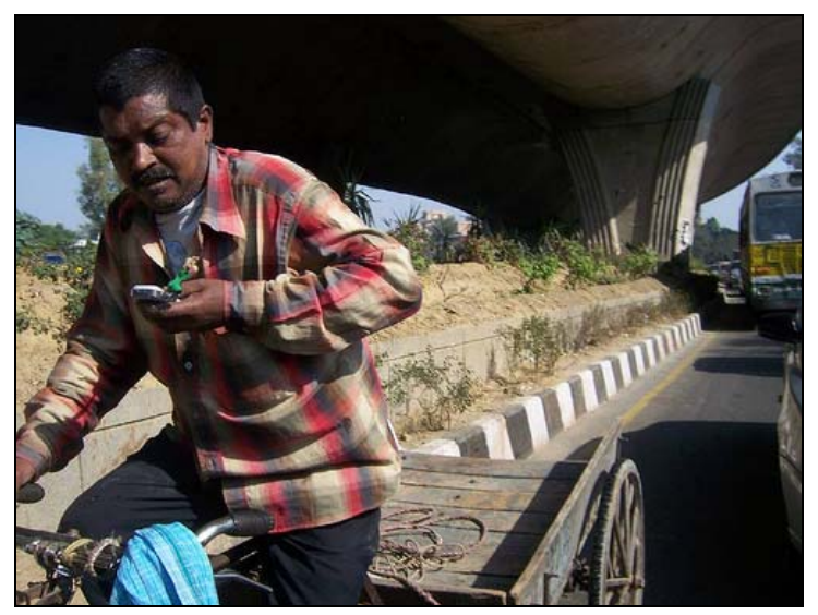
Figure 3. A rickshaw puller in Delhi checking his SMS inbox.

As this review has shown, in India new media technologies create spaces where the old meets the new, and where the tensions around this encounter are played out. Descriptions like "school kids on the street corners swarming around the mobilewallah pushing his cart and generator peddling the latest Nokia N Series amidst a backdrop of chickens, cows, temples, noise, dirt and traffic" are often capturing the scenes in journalistic and popular accounts (MobileYouth, 2008).