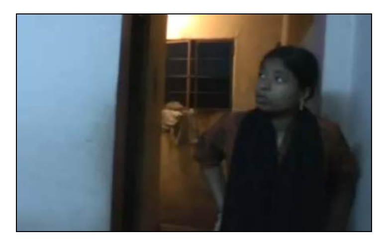
"Freedom" [video] from www.youtube.com

In Delhi, public school students have used a grant from the same Adobe Youth Voices program to produce short videos about their gender-specific experiences of the interaction between home and school life. Many of these videos show young women talking about the double burden of school and housework they are expected to carry. One short is entitled "Freedom" and starts by showing a teenage girl trying to do her homework well past midnight. She is then awakened at 5 a.m. by her mother, declaring "Don't be so lazy" and sending her to start working in the kitchen. Her brother is called to get up an hour and a half later and exhorted to study, while she is cleaning. The mother admits that she loves the son more because he earns more money for the family and because the daughter will incur high expenses, for example at her wedding. The girl concludes that "it's a sin to be born a girl" and asks when she can have the freedom to live her life. The video ends with a male teacher talking about the importance of educating girls, and with shots of girls playing carefree in a park.