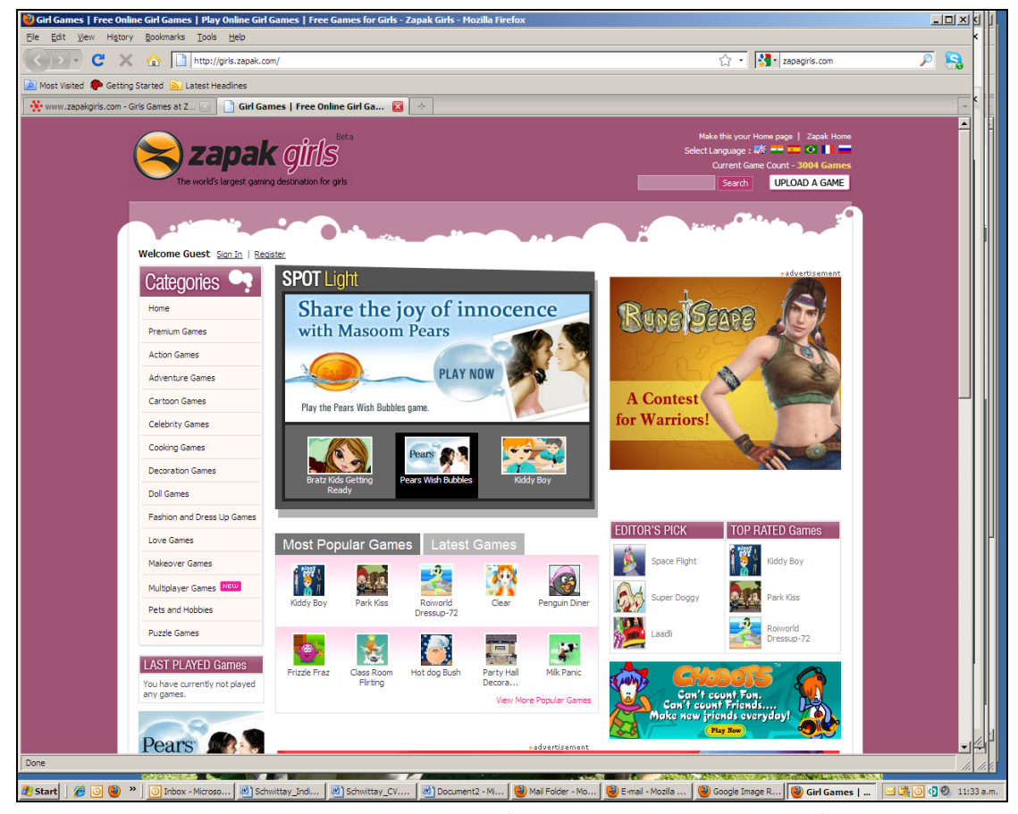
Figure 2. Zapakgirl Homepage.

Similarly, Zapak Tiny provides games for 4- to 7-year-olds, in order to grow the next generation of gamers. One question is whether, as broadband use in Indian homes, which currently stands at about 0.37 per 100 (ITU, 2007), expands, game console usage will increase as well. A related question is whether this might give rise to new dimensions of the moral panic discourse, focusing on addiction or illness. Since gaming has not yet made significant inroads into Indian society at large, until now discourses of gaming addiction have been virtually non-existent, in contrast to countries like South Korea (Ok, this volume). The only such study of Internet use among 16- to 18-year-old students found that a significant number of them were "Internet dependent" (Kanwal & Anand, 2003).