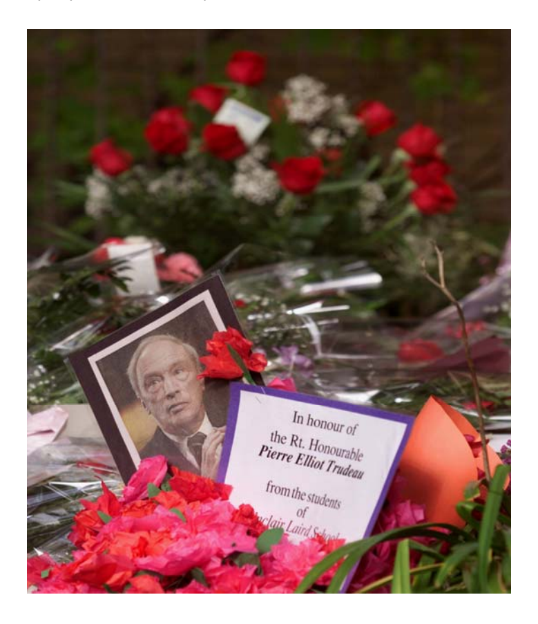
Figure 4 . Flowers and cards left outside the home of Pierre Trudeau in Montreal, Sept. 29, 2000.

The cameras captured the responses of the public, both in "person-on-the-street" interviews and by recording the different gestures that people undertook to mark Trudeau's passing. While Princess Diana's funeral saw mass vigils outside Buckingham Palace and her home with teddy bears, flowers, and notes, Trudeau's funeral saw the public congregating outside his home in Montreal and on Parliament Hill in Ottawa, some clutching notes, and many bringing roses, in remembrance of the fresh rose that Trudeau wore in his lapel every day of his tenure as prime minister.