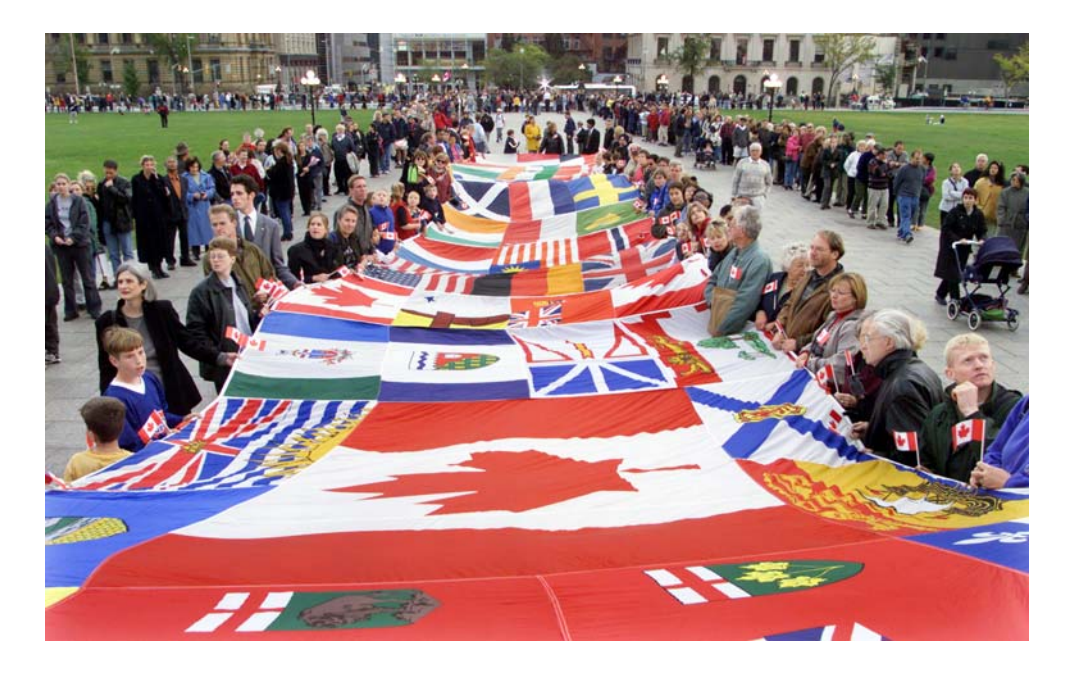
Figure 6 . Giant banner with flags on Parliament Hill in Ottawa, Sept. 30, 2000.

Consistent with the attention to Potter, the diversity of the crowds lining the streets or queuing to view the casket were heavily remarked upon in text and image, in terms of the regions they represented, their ages, and their race and ethnicity. About the crowds in Ottawa, the Canadian Press commented: