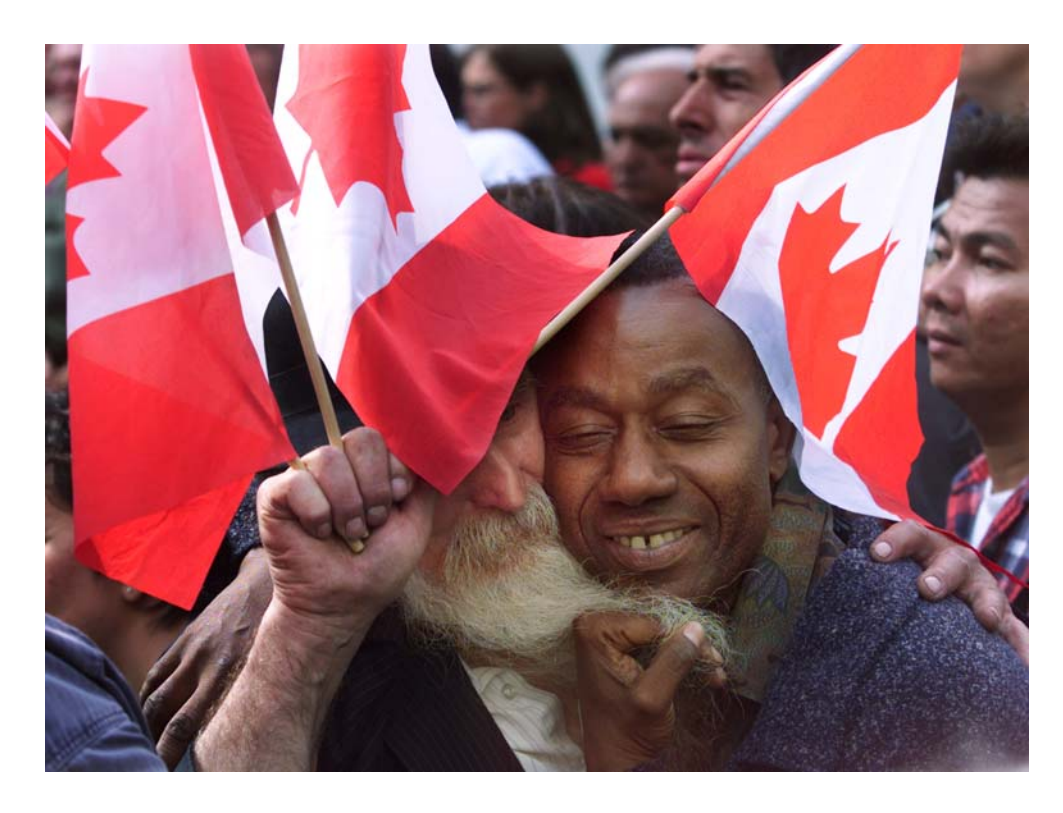
Figure 7. Two Men Embrace after the State Funeral of Pierre Trudeau in Montreal, Oct. 3, 2000.

Of course, it's hard to judge how selective the press were to achieve these images and reports that emphasized unity. Certainly comments like Mandel's suggest that some reporters brought a fair share of sentiment and romance to their work, perhaps more commonly in the tabloid-style papers. The themes of unity and nationalism were prominent in the coverage, particularly in the English-language sources, and evidently there were images and quotes widely available to tell these stories. For those concerned about the ideological nature of "memorial broadcasting," its characteristics are there to be found in the Trudeau coverage, but the extent to which reporters imposed this frame on their stories is difficult to determine. It wasn't the same immigrants, for example, quoted across different news stories, but many different Canadians who had come from other countries and told very similar stories about the importance of Trudeau in that process. Presumably, if no sentiment or attention to emotion appeared in news coverage, it would no longer be an accurate representation of public participation in the events. Without detailed ethnographic reports on all who attended, such as those procured by Lang and Lang (1953) in their study of General MacArthur's return to the U.S., it's difficult to evaluate how the patterns that appeared in the press representations deviated from the "reality" on the ground.