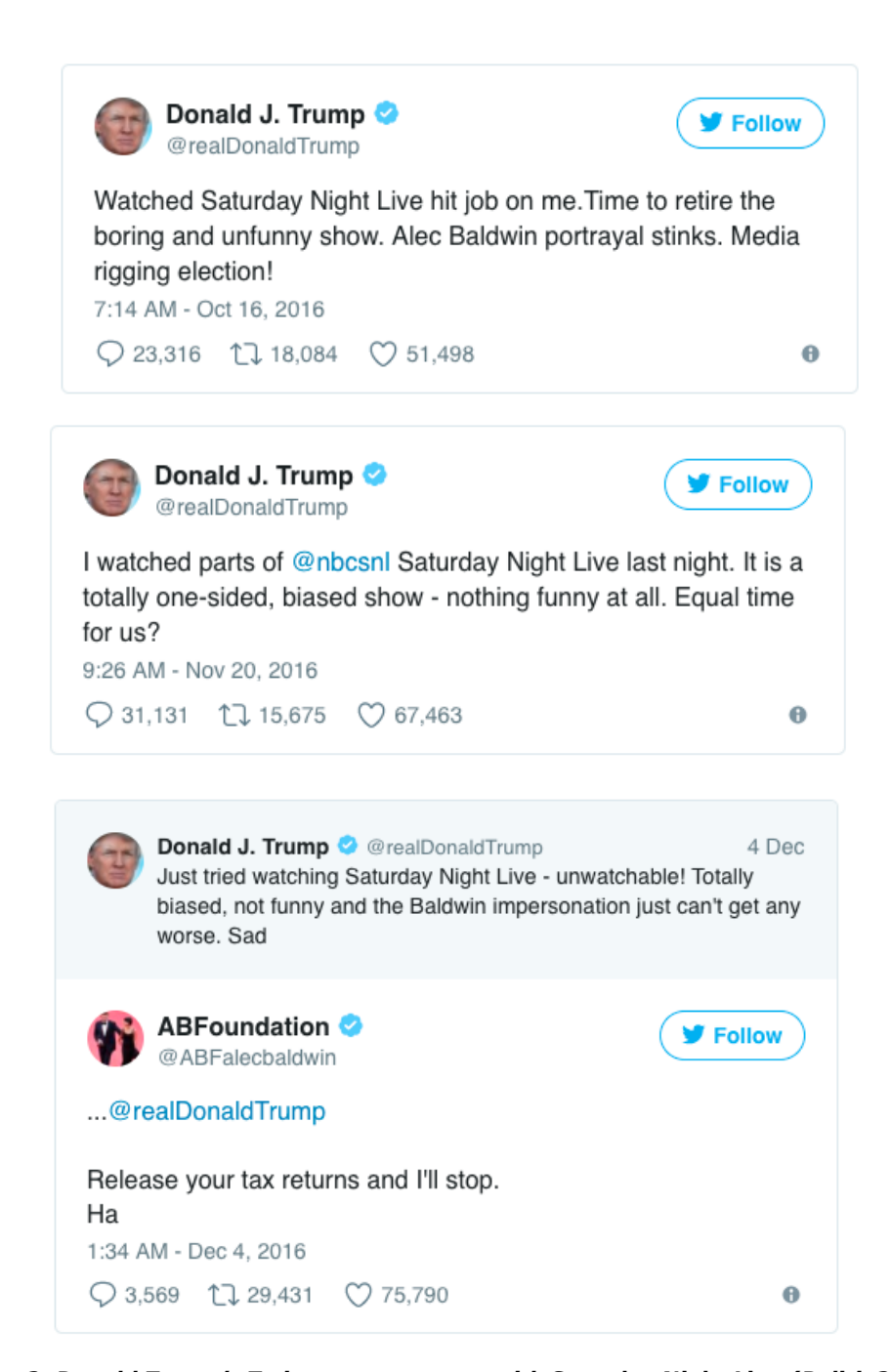
Figure 2. Donald Trump's Twitter engagement with Saturday Night Live (Politi, 2016).