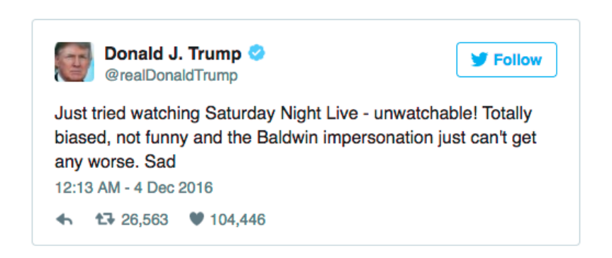
Figure 1. Screenshot of Donald Trump's Twitter response to the December 3, 2016, Saturday Night Live broadcast.

All of the videos were captured via YouTube and edited to remove ads, related video suggestions, and comments. A validation mechanism ensured that subjects could not scroll ahead through portions of the videos and had to remain on the screen for at least 300 seconds before advancing the experiment. Validation mechanisms were also set so that subjects spent an appropriate amount of time viewing and reading either the direct Twitter response or the Slate article detailing Trump's pattern of engagement with SNL via Twitter. Manipulation checks followed immediately after the videos in each condition, and a posttest questionnaire tapped key variables including favorability toward politicians, perceptions of celebrity authenticity, candidate traits, and demographics.<sup>2</sup>