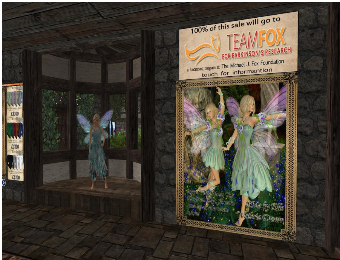
Figure 2. Solas' shop.

In contrast to digital embodied states, the notion of digital objectified states foregrounds the importance of digital materiality—of virtual "objects and media, such as writings, paintings, monuments, instruments, etc." For both DB and Solas, virtual objects from clothing to buildings were as important as embodiment.