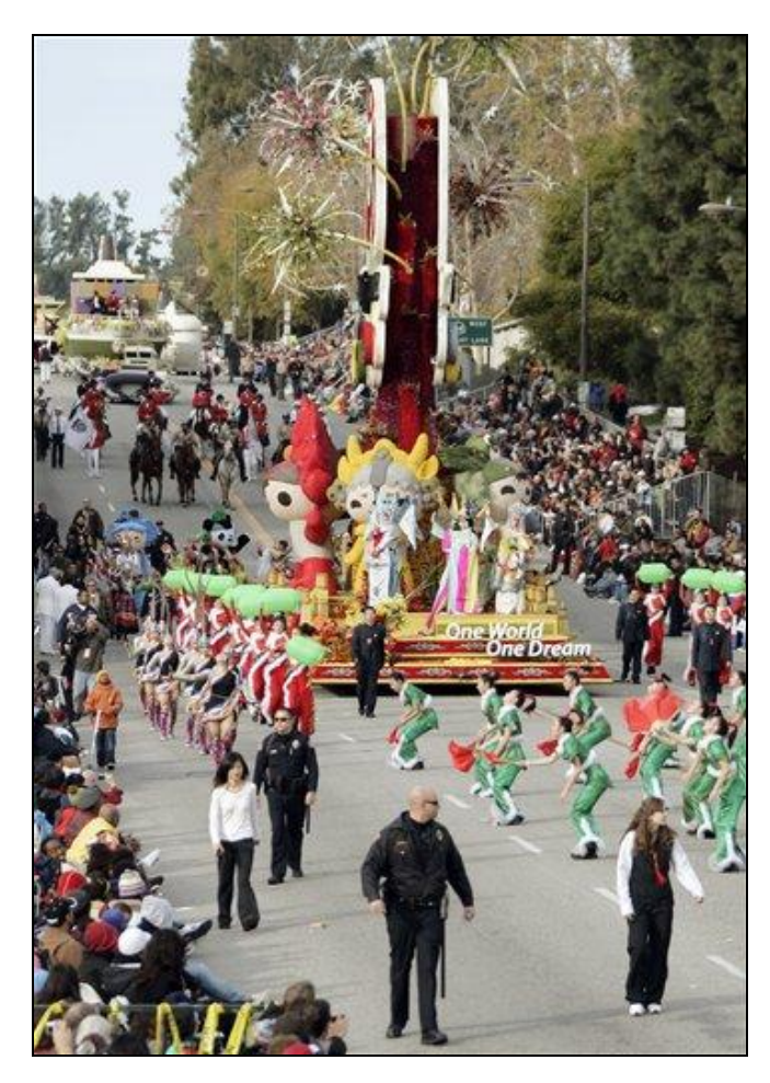
Figure 4: The Beijing Olympics float in the Pasadena Rose Parade, Jan. 1, 2008.