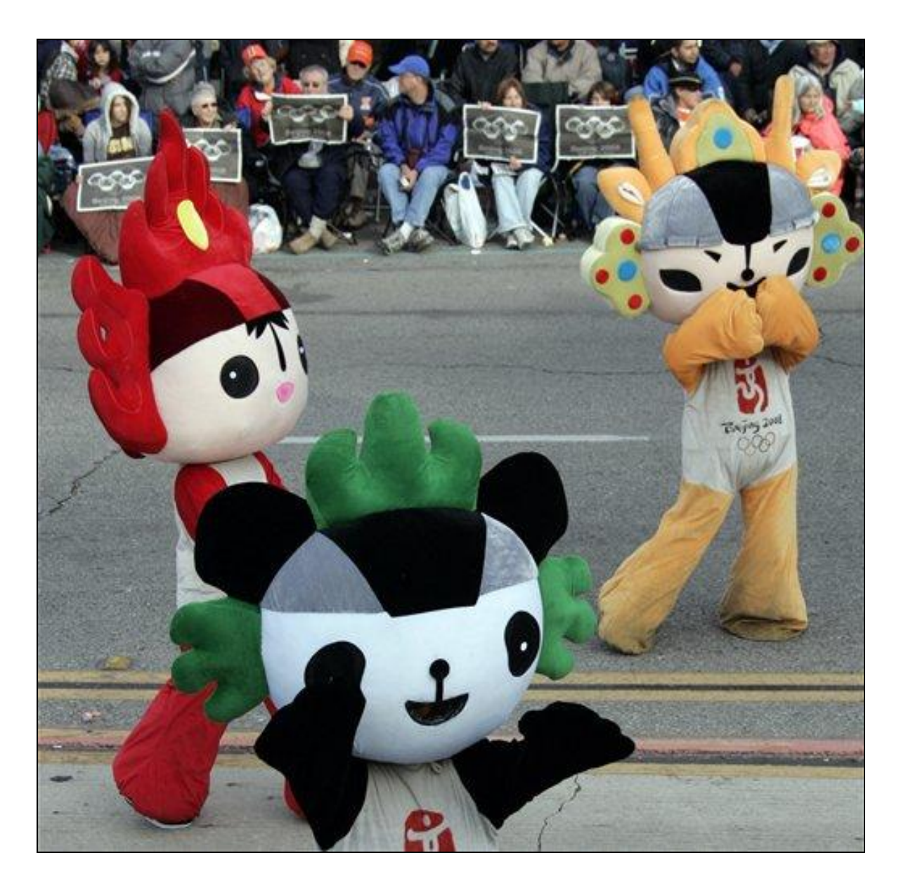
Figure 5. Beijing Olympic mascots accompanying the float pass protesters in Pasadena Rose Parade, Jan. 1, 2008.