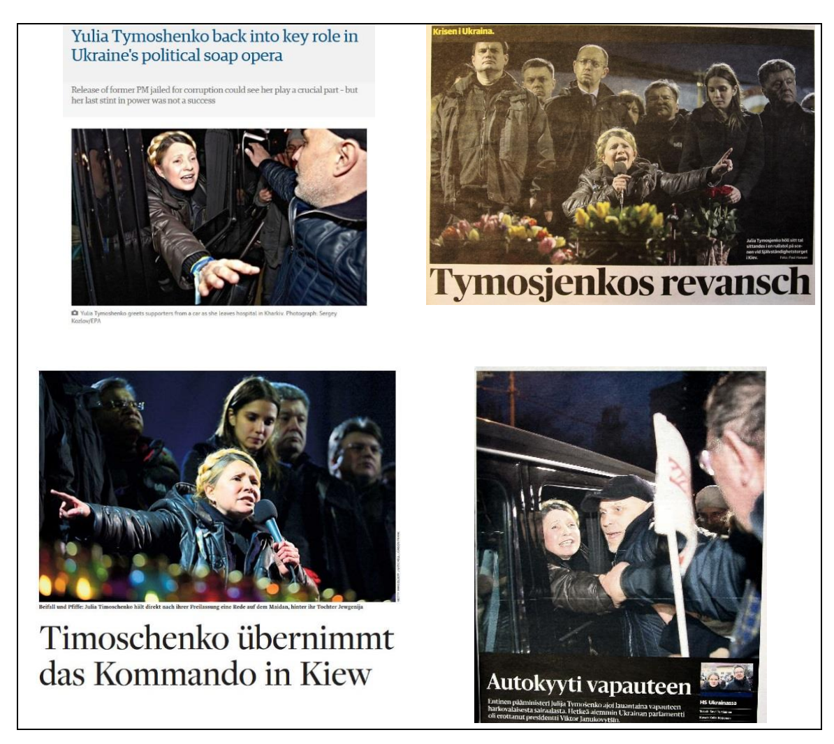
Figure 2. Symbolizing a popular struggle for freedom.

this way, Ukraine's internal political struggles were rendered largely invisible after the Maidan period, and aside from a single article in DN on July 21, 2014, the newspapers featured no images of the leaders of the self-proclaimed People's Republics of Donetsk and Luhansk.