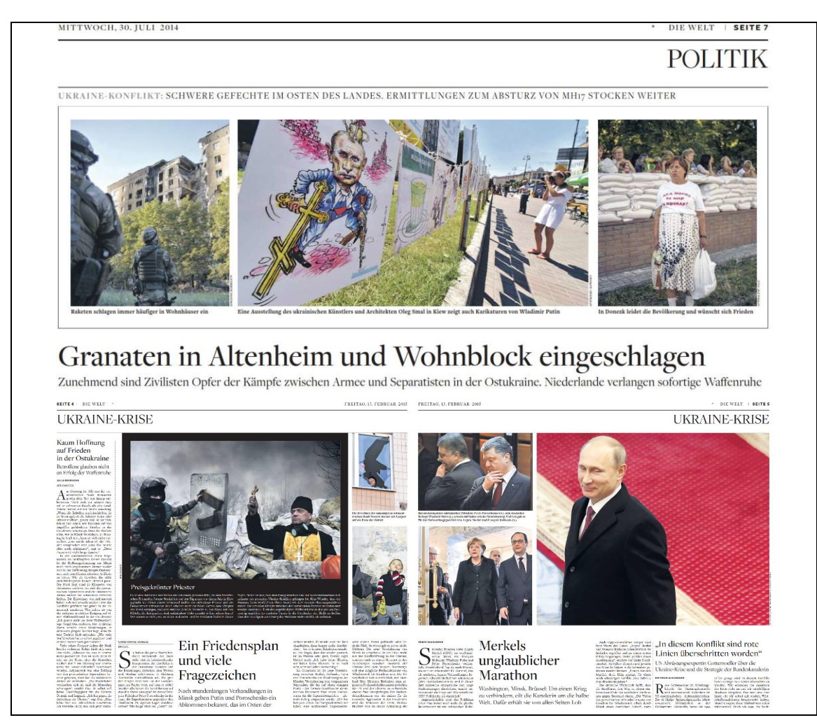
Figure 5. Implying Putin's aggression, power, and responsibility.