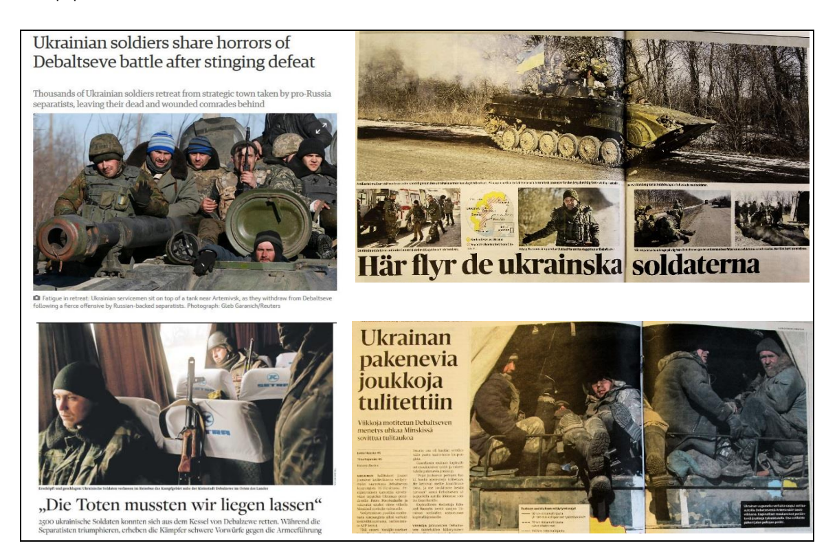
Figure 6. Empathizing with Ukrainian soldiers.

Notably, no such pictures were published of separatist troops. It is also worth noting that the papers customarily labeled the soldiers as "Ukrainian," so denoting the other party as non-Ukrainian. Additionally, images of the soldiers commonly highlighted Ukrainian flags or Ukrainian colors in the soldiers' uniforms or equipment.