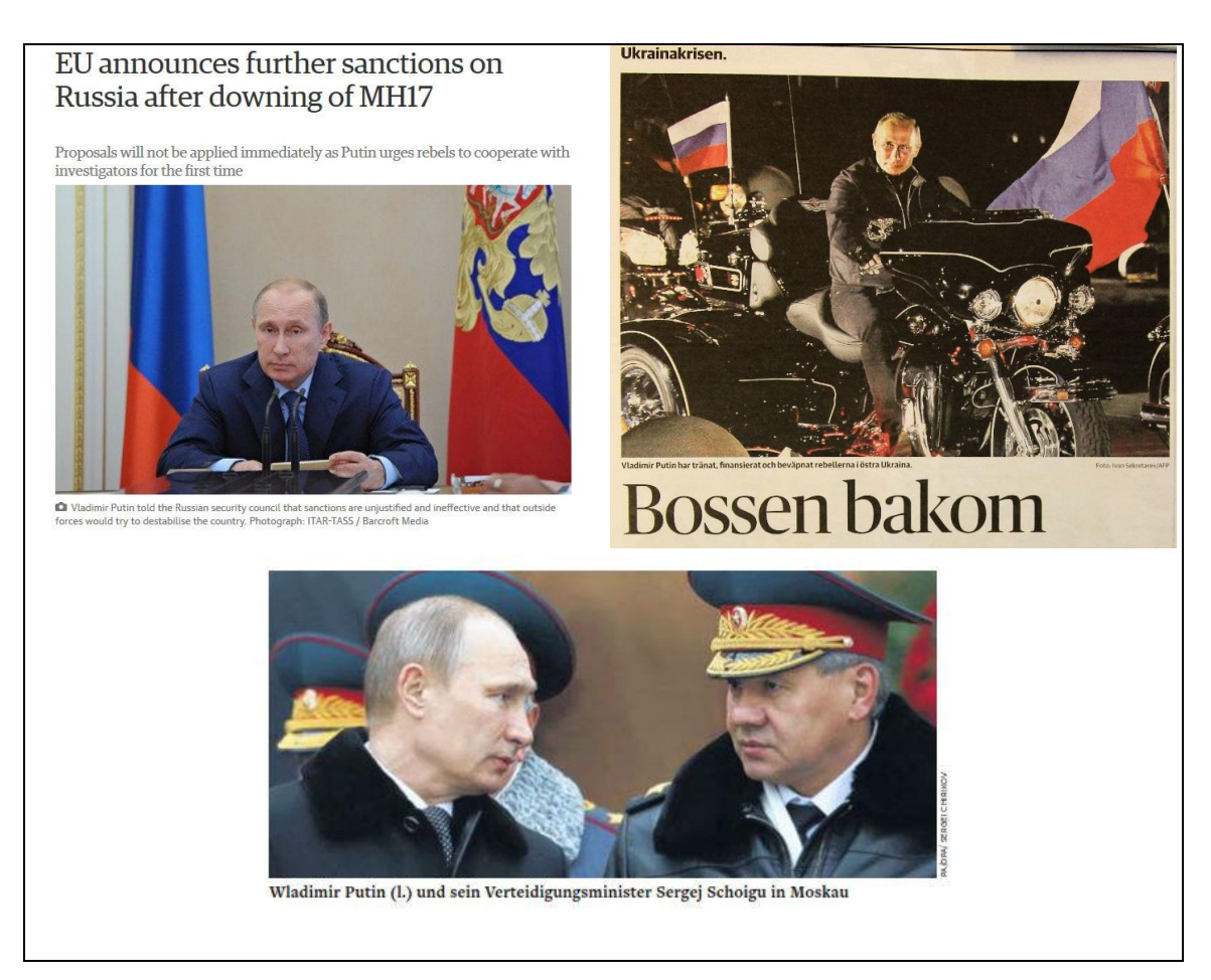
Figure 3. Othering Putin.

International Journal of Communication 11(2017)