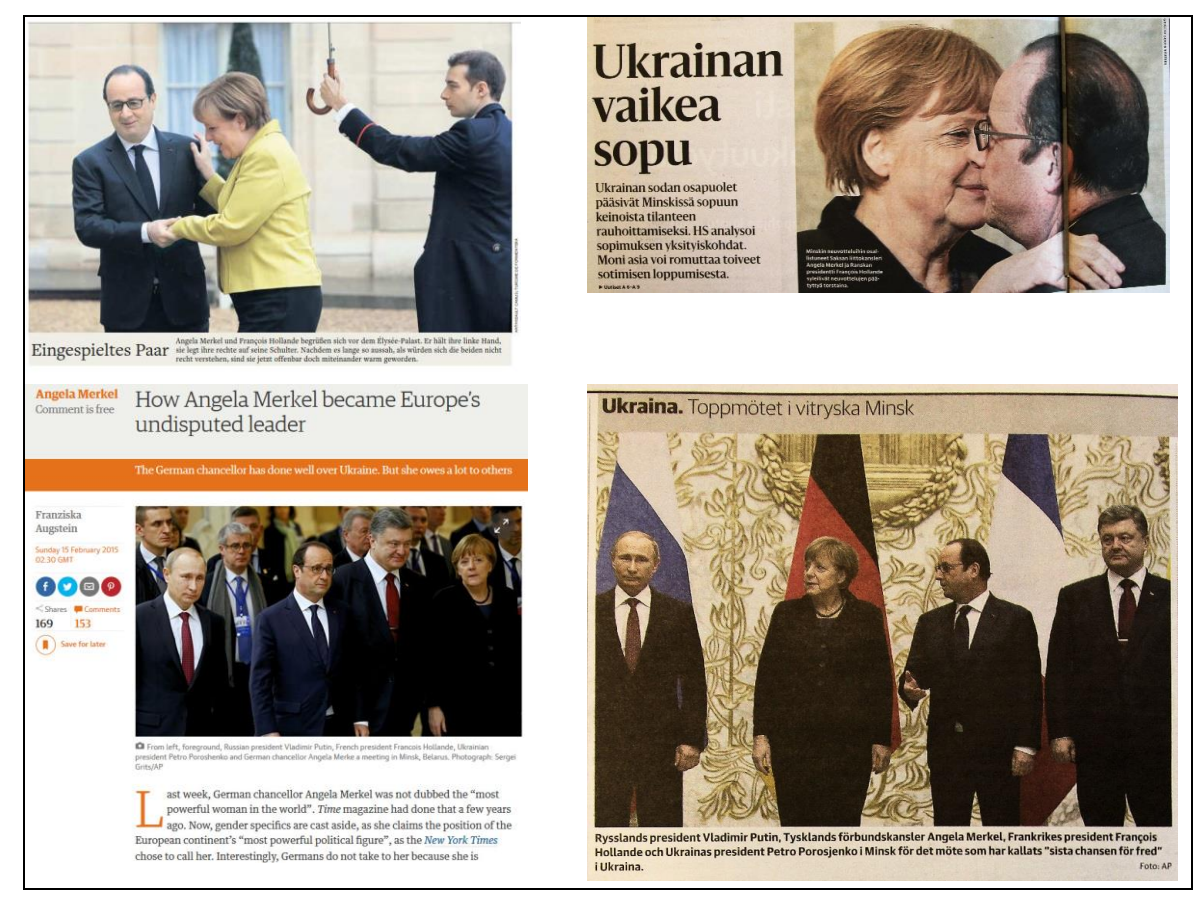
Figure 7. Visualizing Western closeness and Russian isolation.

Sources: Die Welt, February 21, 2015, p. 1 (photo: Thibault Camus/AP); Helsingin Sanomat, February 13,2015, pp. A2-A3 (photo: Grigori Dukor/Reuters); The Guardian(www.theguardian.com/commentisfree/2015/feb/15/angela-merkel-germany-ukraine-putin-obama),February 15, 2015 (photo: Sergei Grits/AP); and Dagens Nyheter, February 12, 2015, p. 14 (photo: AP).