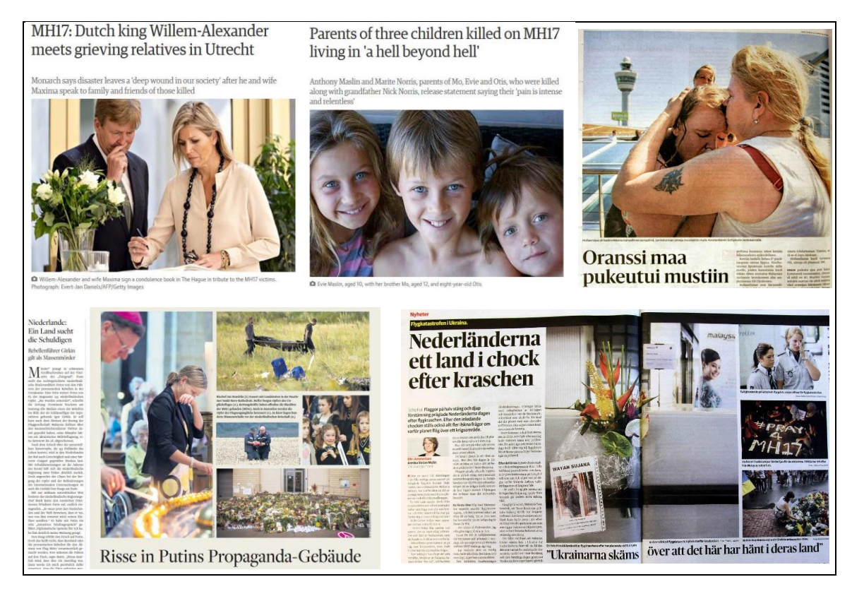
Figure 8. Visualizing Western victimhood.

Sources: The Guardian (www.theguardian.com/world/2014/jul/21/dutch-king-willem-alexander-meetsmh17-relatives-utrecht), July 21, 2014 and (www.theguardian.com/world/2014/jul/23/parents-of-three-children-killed-on-mh17-living-in-a-hellbeyond-hell) July 24, 2014 ; Helsingin Sanomat, July 24, 2014, p. A22 ; Die Welt, July 21, 2014, p. 4 ; and Dagens Nyheter, July 19, 2014, pp. 10–11.