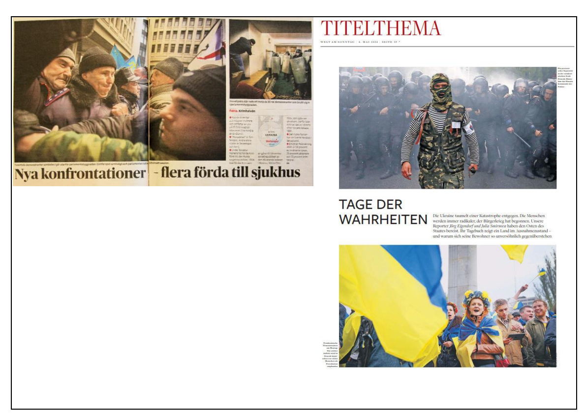
Figure 1. Visualizing a divided nation.