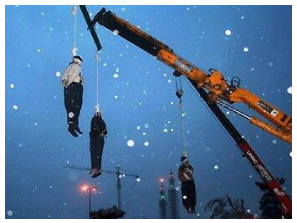
Figure 9. Public execution. October 6, 2013.

Other tweets have addressed the matter of aggressive regime measures in a more humoristic yet still critical manner. In a caricature shared under #IranJeans, Mana Neyestani, a well-known Iranian artist, assures Netanyahu that Iranians do wear Jeans. The image shows a woman in a veil being chased by an armed soldier/police officer while both are wearing jeans (see Figure 10). The female character says, "You see, Netanyahu, we all wear jeans." The caricature sarcastically portrays the complexity of the situation highlighted in Netanyahu's interview and later in the circulation of the hashtag.