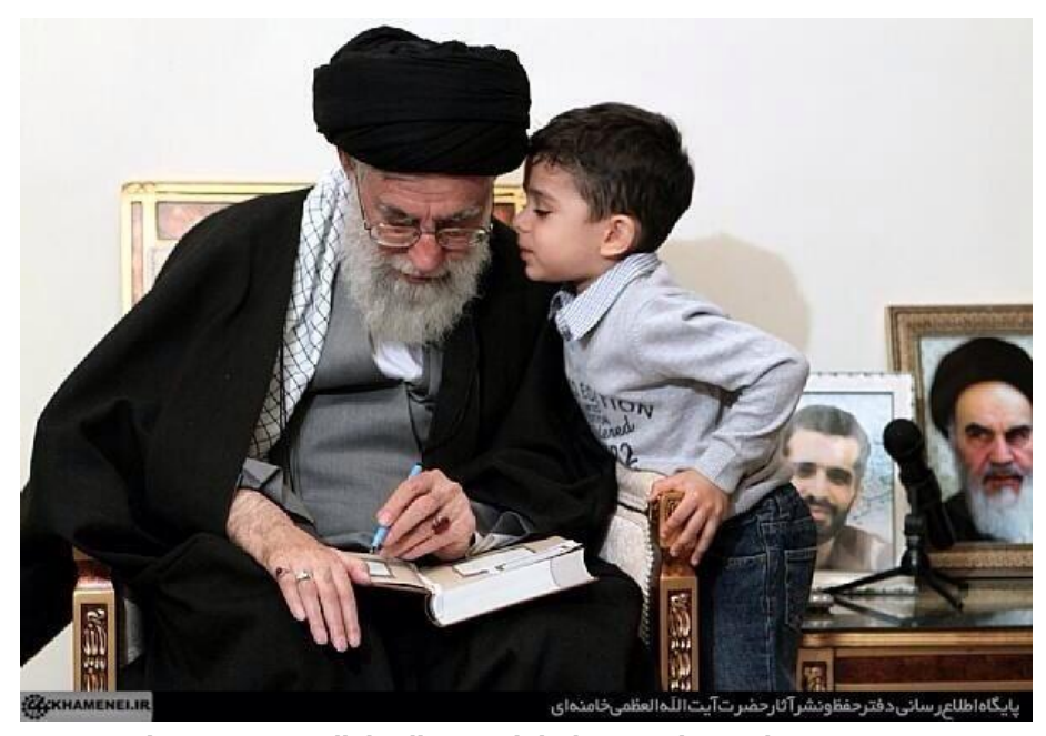
Figure 6. Ayatollah Ali Hosseini Khamenei. October 6, 2013.

like never before. On the one hand, using the symbol of the jeans under #IranJeans leads to the reconstruction of existing cultural binaries, namely, West versus East cultures. Here, users also downplay the impact of the Iranian regime on the levels of freedom experienced by different groups, such as women, political opposition groups, and so on. On the other hand, we do see users' engagement in discussions that were relatively closed for them thus far, contributing unique images and perspectives about Islam. Bringing multiple identification markers into this new space of interaction, users exemplify the complex nature of identity construction processes, opposing while affirming cultural oppressions.