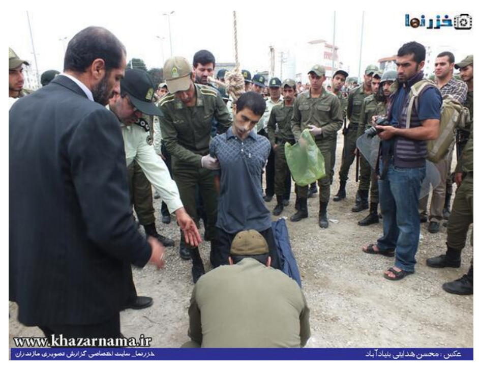
Figure 8. Public execution. October 6, 2013.

Additional public executions are presented by users (see Figure 8 and Figure 9) to stress non-Western conduct in Iran. Whereas Netanyahu argues that jeans represent the West and the chain of signified (freedom, democracy) associated with it, users argue that jeans are not a scale on which freedom, liberty, and democracy should be measured. As one of the users suggests alongside an image of execution, "This is Iran today. Look, they really wear jeans!" (see Figure 9). These arguments do not necessarily support Netanyahu, but rather point out the fallacies in associating jeans with freedom and the West. The argument constructed under the hashtag evolves, bringing conflicting voices into a discussion about the nature of Iranian national identity. The same symbolic richness that allowed users to use jeans to draw similarities between Iran and the West now serves the opposite argument, revealing the arbitrary use of attire as an identity marker. Both #IranJeans and jeans themselves evolve through this discussion, becoming signifiers of two opposite arguments about Iran's Western and non-Western nature. The two signifiers encompass, at once, the two sides of the Western-Eastern binary, representing Iran as simultaneously Western and non-Western.