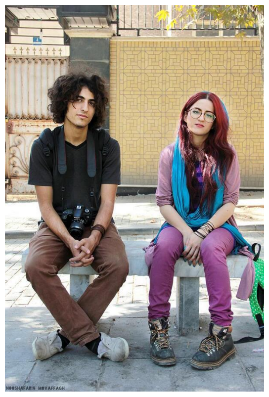
Figure 4. "Hipsters outside #Iran's Museum of Cinema." October 9, 2013.