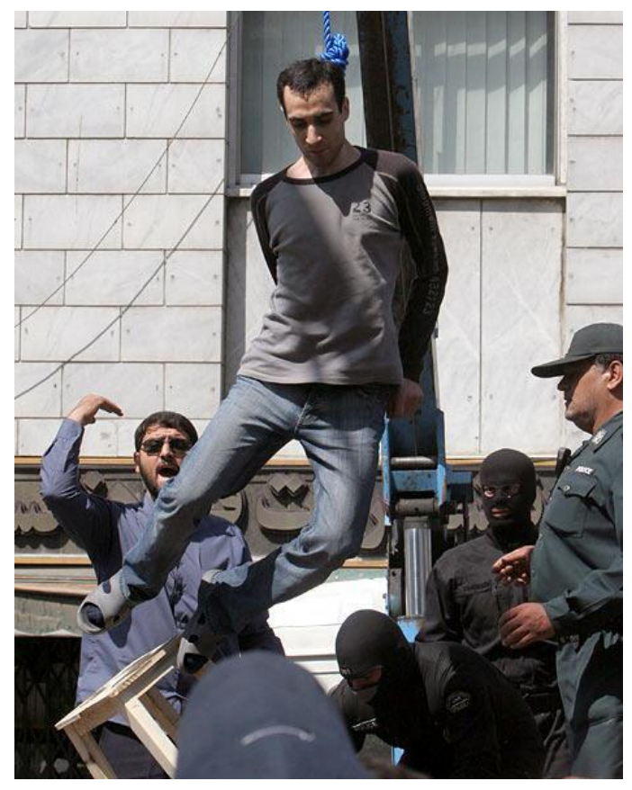
Figure 7. Execution of Majid Kavousifar. October 8, 2013.

worldwide. Stand for international human rights." The image shared by this user is the execution of Majid Kavousifar, an Iranian citizen, executed by the Iranian regime in 2007 (see Figure 7).