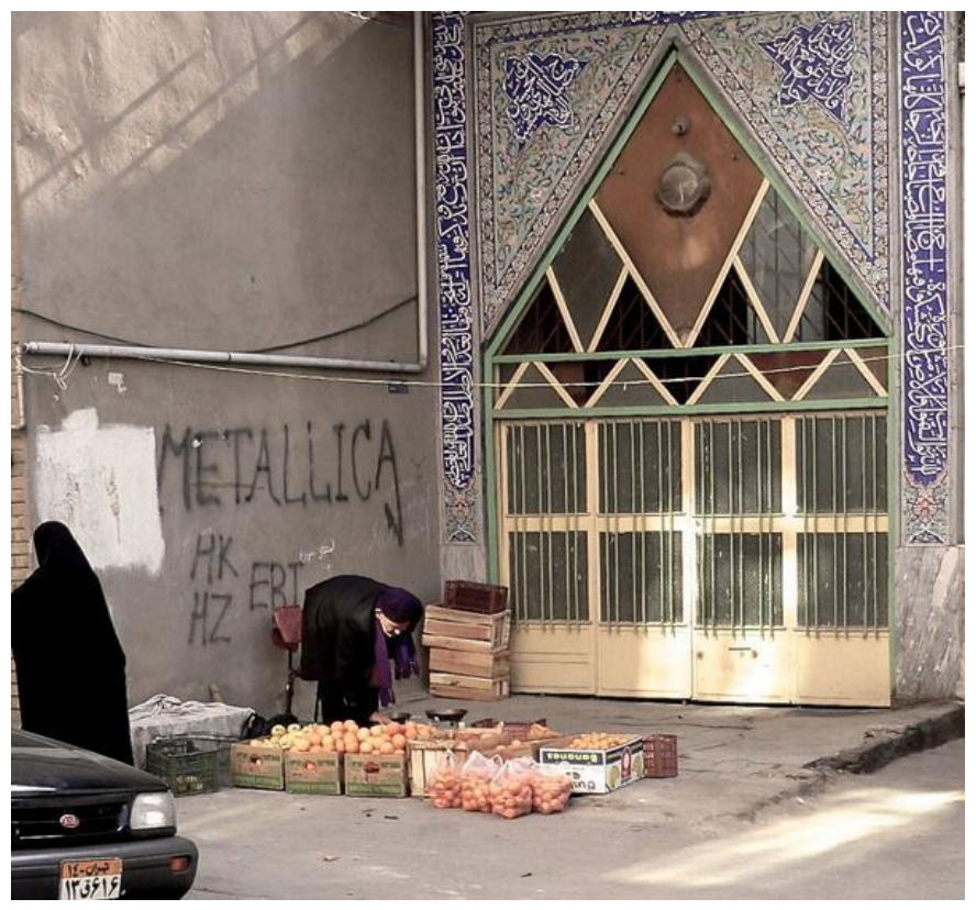
Figure 2. Metallica's band logo street graffiti. October 10, 2013.

By using the hashtag on Twitter, users find a unique space to negotiate their identity and refute cultural misconceptions on a transnational level. They bring together varying influences, local and global, Western and Iranian, and secular and religious, to stress the Western nature of the Iranian identity. The Iranian national identity constructed by Twitter users under #IranJeans challenges the readily used terms of West versus East and calls for a more nuanced discussion of the different levels in which these are experienced in every society and identity. This construction process works in the logic of the third space, as conceptualized by Bhabha (1994), allowing users to recontextualize the Iranian identity and fuse multiple identity markers and present them anew.