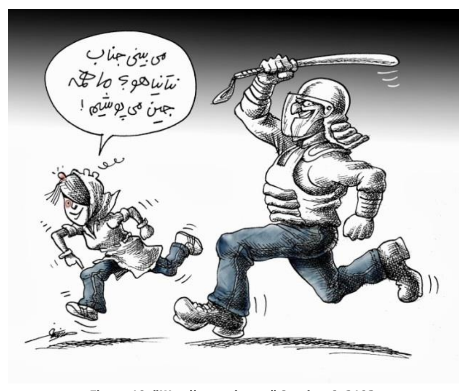
Figure 10. "We all wear jeans." October 6, 2103.

First, as argued in the shared image, Netanyahu is wrong and Iranians are in fact allowed to and do wear jeans freely. The added commentary, however, implies that jeans do not reflect the well-being of citizens in Iran. This criticism is directed at the Iranian government and Iranian people at the same time; calling out the fact that Iranians wear jeans and Netanyahu is wrong does not make the Iranian regime less aggressive toward its citizens. In a way, Neyestani's tweet notes that when it comes to questions of culture and politics, the situation is too complex to be addressed through one lens and one single symbol. The tweet criticizes the Iranian state and government but also calls the Iranian public to rethink Iranian identity as it is presented in Netanyahu's statement as well as in other users' tweets tagged under #IranJeans.