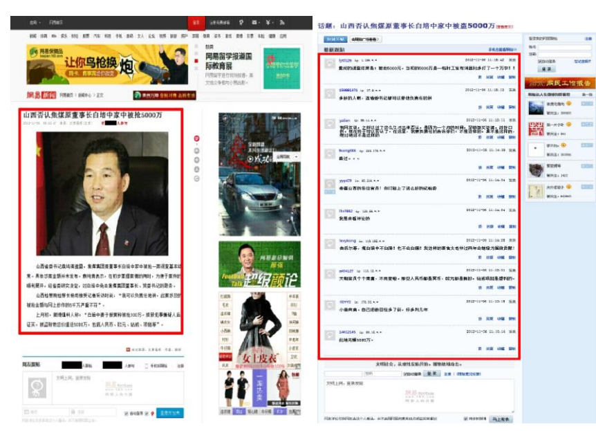
Figure 2. The layout of the stimuli. The stimuli were placed inside red frames. Other content on the news (left) and comments (right) pages was the same across conditions.