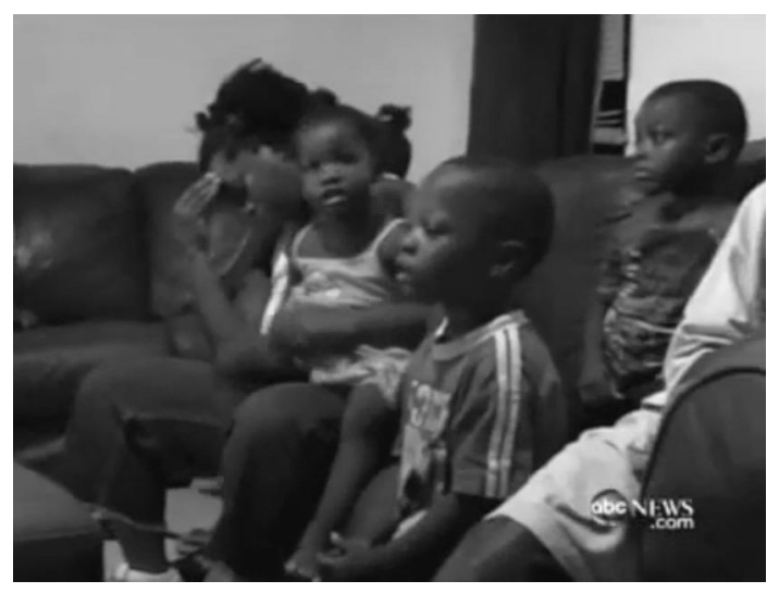
Figure 2. Sample image from the personalized news story about corruption in public housing organizations across the country. This family lives in a public housing project in Sanford, Florida, that is falling apart and was featured in an ABC News broadcast.