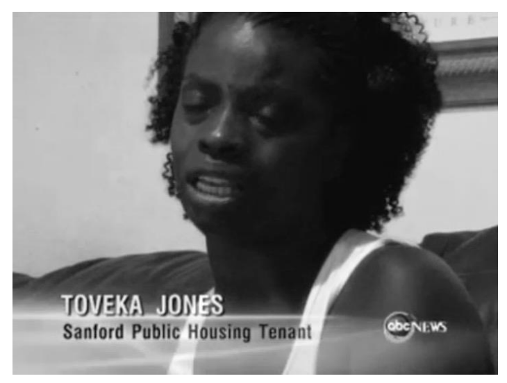
Figure 3. Sample image from the personalized news story about corruption in public housing organizations across the country. This is the mother of the family living in the public housing in Sanford, Florida, speaking to ABC News about her situation.