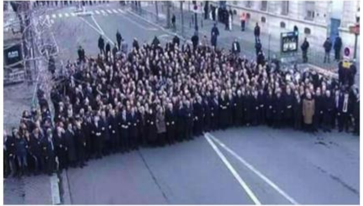
Figure 3. World leaders attend a Paris rally—but do not lead the march.