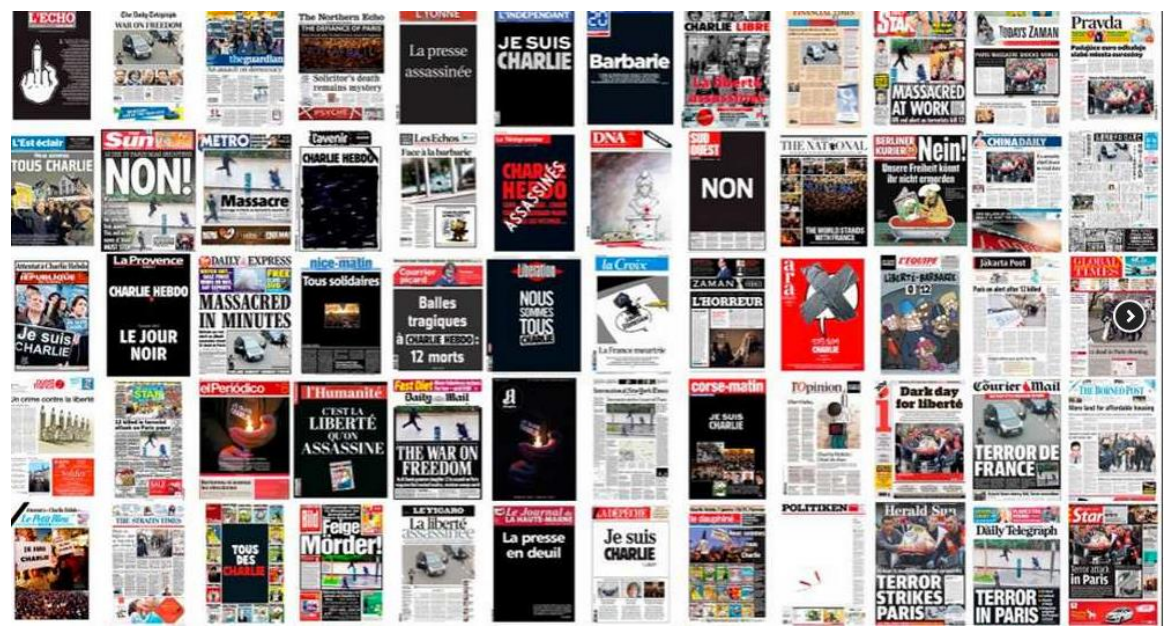
Figure 1. Press headlines from around the world about the Charlie Hebdo attack.

I am trying to understand the phenomenon that in a widely accepted shorthand has become known simply as "Charlie Hebdo" as an instantiation of a number of allied issues in the analysis of global mediated politics. The saturation media coverage reminded me of Steven Hawking's early notion of the "event horizon" that describes a boundary in space-time, or "the point of no return" where a gravitational pull becomes so great as to make escape impossible. In many ways, across Europe and elsewhere, the Charlie Hebdo "media event horizon" in January 2015 functioned in that manner, with a gravitational pull that both blacked out other news stories that on another day would have made headlines and also seemed to demand a response from everyone. Put simply, this particular framing of Hebdo was as a mediated spectacle.