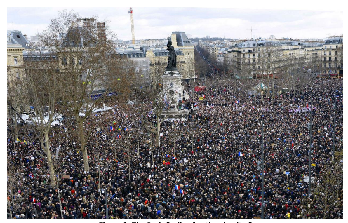
Figure 2. The Paris "rally of national unity."

Another 3.7 million people joined demonstrations across France. The phrase "je suis Charlie" (I am Charlie) became a common slogan at the rallies and across social media.<sup>2</sup> Numerous world politicians turned up in Paris in support of press freedom. Ironically, among them, nine of the countries represented were in the bottom third of the 2014 World Press Freedom Index as compiled by Reporteurs sans Frontières (2015): Algeria, Mali, Ukraine, Tunisia, Palestine, Jordan, Russia, Turkey, and Bahrain. The initial photographs suggested that these great and not-so-good political figures were leading the march, while later photographic evidence revealed that was not the case, rendering it an interesting example of a