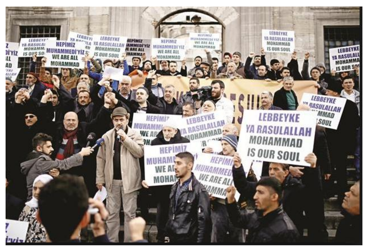
Figure 4. A counterdemonstration in Turkey.

But there were plenty of contrary and negative responses. Rallies in Turkey and Indonesia, which enjoys the largest Muslim population in the world, changed the identification to "We are all Mohammad."