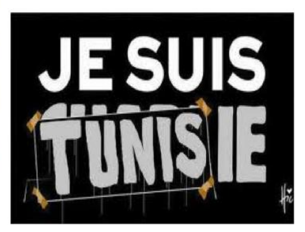
Figure 7. A new "je suis" meme after the attack on the Bardo Museum in Tunis.

On June 26, 38 tourists were killed by an armed gunman on a Tunisian beach; this was readily linked by media analysts to the previous Bardo violence but not to Hebdo. How events chain or become chained together, what traces one link to another, and what discourses claim to make those links is the very stuff of contemporary history making in which the media themselves often play immediate and central roles. It appears that even the meta-level, overarching war on terror discourse still allows for possible differentiation within national contexts.