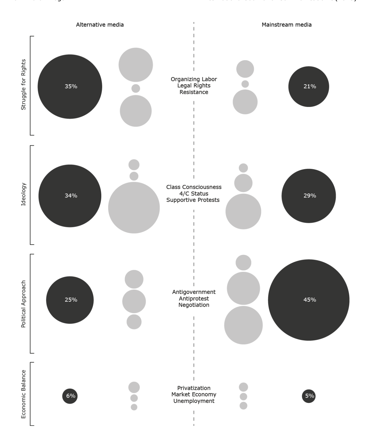
Figure 1. Distribution of frames and issue components.