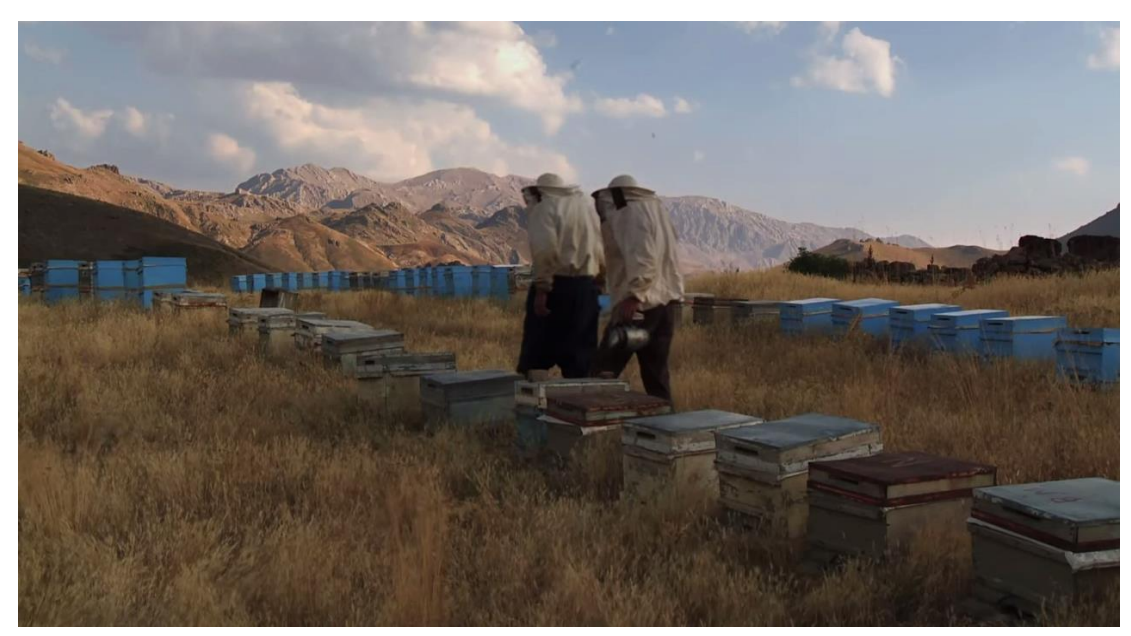
Figure 5. Still from The Beekeeper, Mano Khalil (2013), copyright Frame Film.