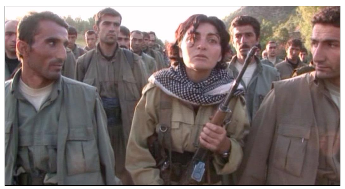
Figure 2. Still from the film Bêrîtan by Halil Dağ (2006), copyright Halil Dağ.

2002), and his most famous film Bêrîtan (2006), all set in the mythical Kurdish mountain landscape (see Figure 2). His films have sometimes been described as "mountain cinema." Typically for battle cinema, Dağ's work is popular among Kurdish activists but largely unknown to the general public. Very little information can be found about him beyond (activist) Kurdish media, and academic literature about Kurdish cinema is scarce (Horat, 2011, for instance, does not discuss Dağ). Still, whenever Dağ is discussed, his unique position in Kurdish cinema is recognized (Arslan, 2009; Gündoğdu, 2010). On his position as both a guerrilla fighter and a filmmaker, Dağ stated, "I am a guerrilla fighter but I will be director until somebody else makes films about the guerrillas" (quoted in Gündoğdu, 2010, p. 9). In April 2008, Dağ died during a fight between PKK and the Turkish army. Dağ's tragic end illustrates that, for the filmmakers of battle cinema, a lot more than filmmaking is at stake.