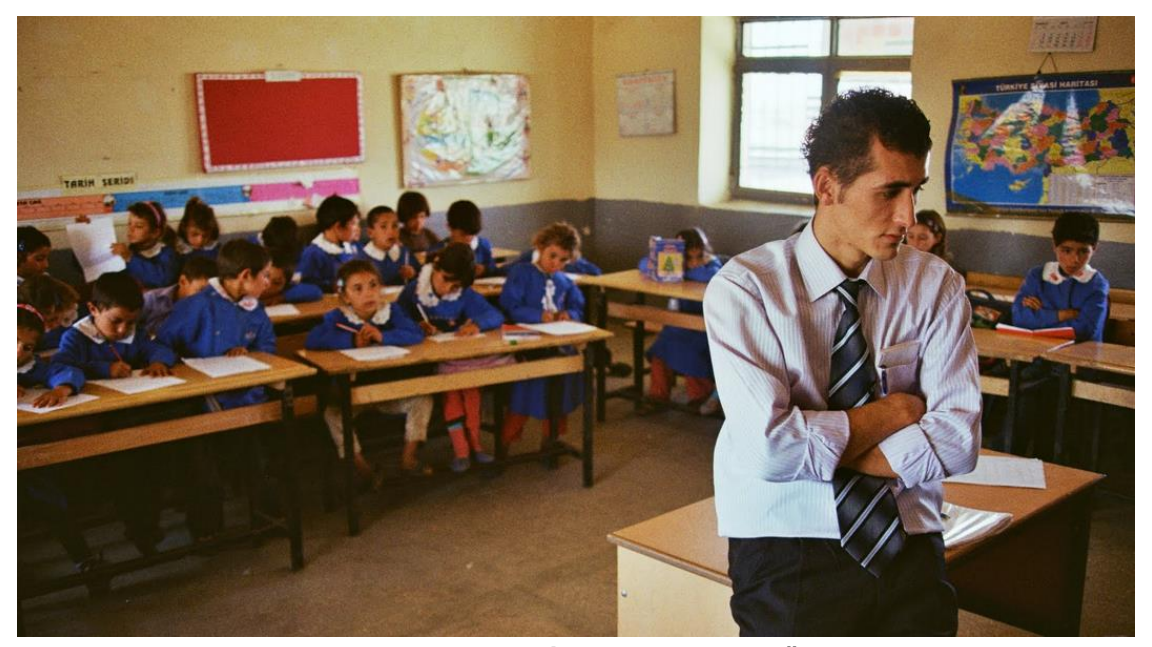
Figure 3. Still from the film İki Dil Bir Bavul by Özgür Doğan and Orhan Eskiköy's (2008), copyright Perişan Film.

himself a Kurd and affected by the conflict, Yavuz attempts to draw attention to both Turkish and Kurdish perspectives, thus aiming for a truthful representation. The documentary is a trip through Europe in search of former fighters, refugees, and victims of the conflict, joined with traveling shots, images of stations, and public life. Throughout the testimonies, the message prevails that both sides will have to compromise to resolve the conflict. The conflict is examined critically, but not necessarily by attributing responsibility to a particular party.