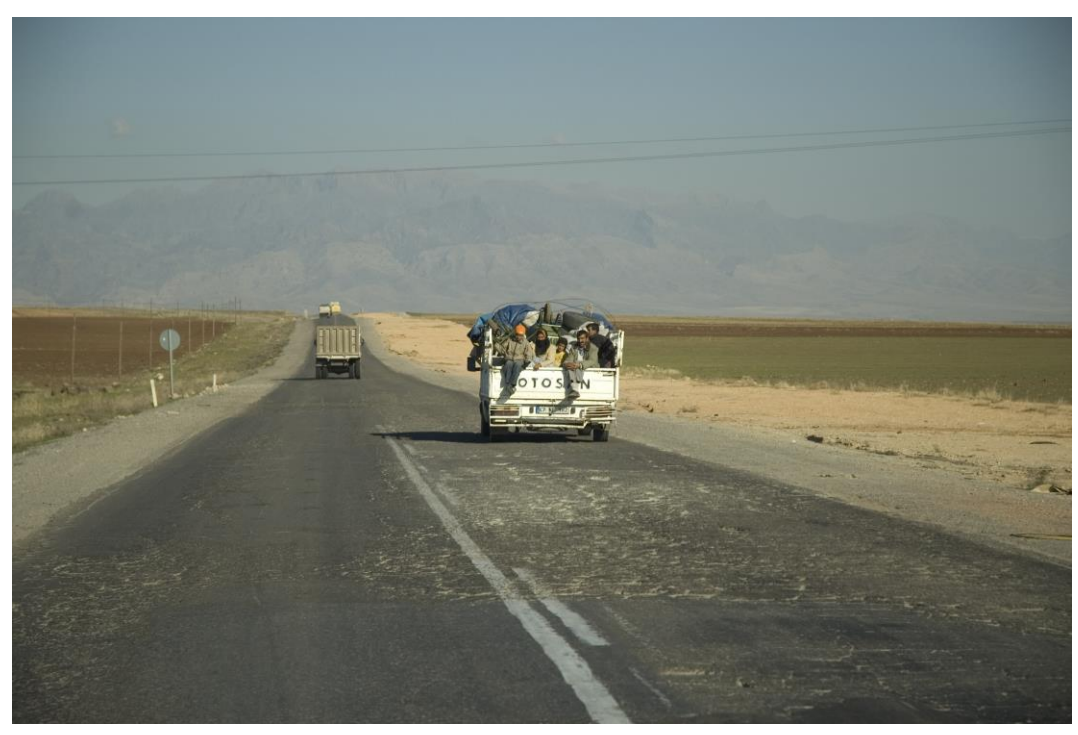
Figure 4. Still from Close-up Kurdistan, Yüksel Yavuz (2007).

Despite the emotional involvement of these filmmakers in the conflict, they attempt to approach it in a balanced way. This results in an interesting and necessary addition to the more insider perspectives of battle cinema and victim cinema.