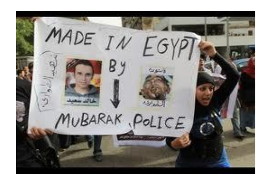
Figures 5 and 6. Convergent meaning of banderoles in Egyptian protests.

Images were also used as visual records, argues Lina Khatib (2013). They circulate among both nondigital and digital media, serving bloggers and television channels by documenting the spectacles. Whether recorded on mobile phones or digital cameras, images were used strategically and tactically. Khatib reports how a manual named "How to Protest Intelligently" advises people how to protest. The manual is distributed both online and offline and demonstrates "a high awareness of the visual message sent by the style of the protests, and the power of symbolism" (p. 145). The manual includes various tactics such as instructions for taking pictures of protesters carrying roses and flowers and heading to targets such as government buildings; other instructions include taking pictures of veiled and unveiled women to show the inclusiveness of the protests (p. 146).