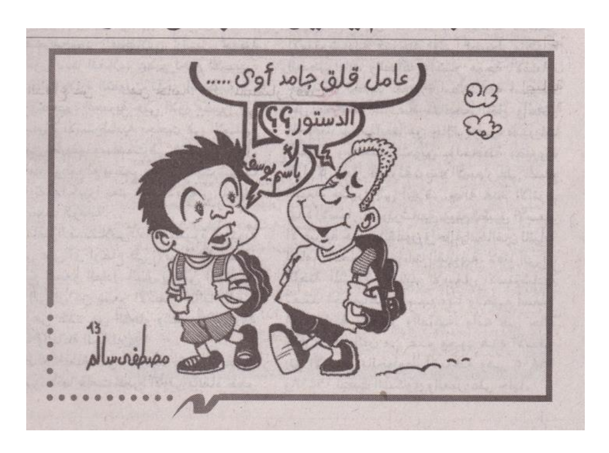
Figure 7. The Bassem Youssef's effect (1).

Translation: First, left: "It's making a lot of trouble." Second, right: "The constitution??" First: "No, Bassem Youssef." (By Mostafa Salem. Published in Al-Shorouk Newspaper, September 10, 2013. Available at http://oumcartoon.tumblr.com)