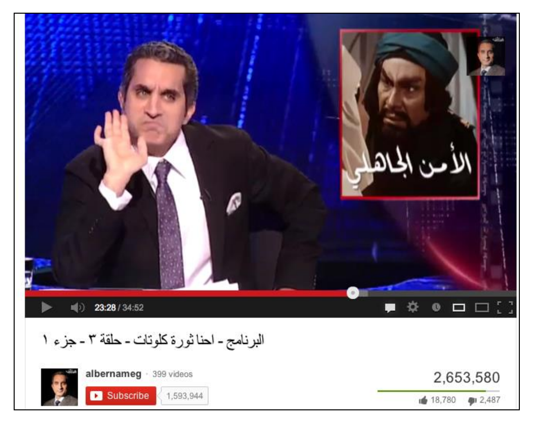
Figure 1. Bassem Youssef in el-Barnamag.

Ironical and satirical programs also transcend Tunisian media. TV shows such as Labes [ No Problem ] or radio sketches such as "Seyes Khouk" ["Go Easy on Your Brother"] are known for criticizing the state apparatus through a mimicking, satirical tone. A different genre, parody, is broadcast on Nessma TV. According to Denith, parody is "a relatively political imitation of a given cultural practice, one that employs exaggeration, often to the point of ludicrousness, to invite its audience to examine, evaluate, and re-situate the genre and its practices" (as cited in Baym, 2005, pp. 269–270). Les Guignols du Maghreb [Maghreb's Puppets] is a show with puppet characters that represent national and international political personalities. Inspired from Les Guignols de l'Info [News Puppets], a French political parody on the Canal+channel, the puppets embrace political personalities as well as public figures and use playful roles that discredit their positions while highlighting their confusing political discourse.