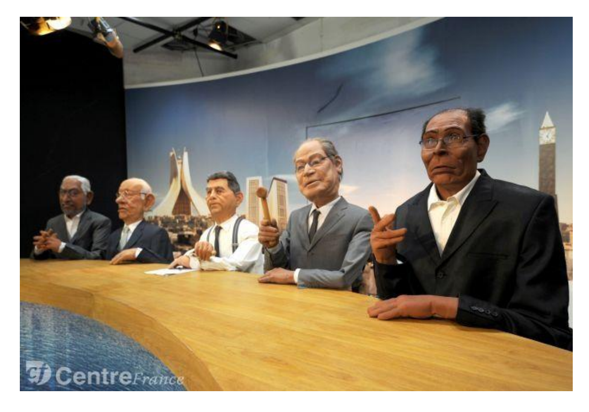
Figure 2. Tunisian puppets Les Guignols du Maghreb.

In general, Waugh states that satire is "aimed at inconsistency and hypocrisy" while guided by the objective of pointing out "the deficiencies in certain human behavior and the social issues which result from them in such a way that they become absurd, even hilarious, which is therefore entertaining and reaches a wide audience" (as cited in Leroux & Riutort, 2013, p. 39). While the Tunisian talk show hosts at first received a lot of pressure from politicians and public institutions for producing such satirical programs, this tension has now eased and the programs continue to run. However, their constructive aspect seems to have diminished since they are no longer followed by "effective acts." Thus, their threatening quality seems to have vanished.