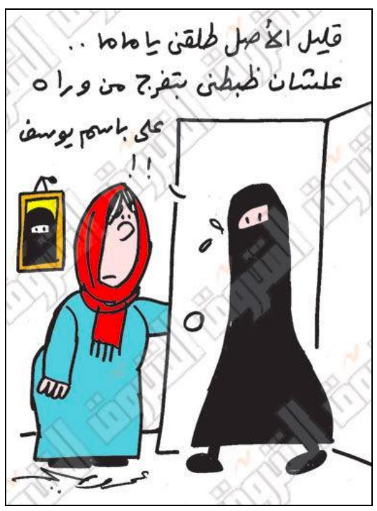
Figure 8. The Bassem Youssef effect (2).

Translation: "The son of a bitch divorced me mammy, because he caught me watching Bassem Youssef behind his back!" (By Amro Selim. Published in Al Shorouk newspaper , December 27, 2012. Available at http://oumcartoon.tumblr.com.)