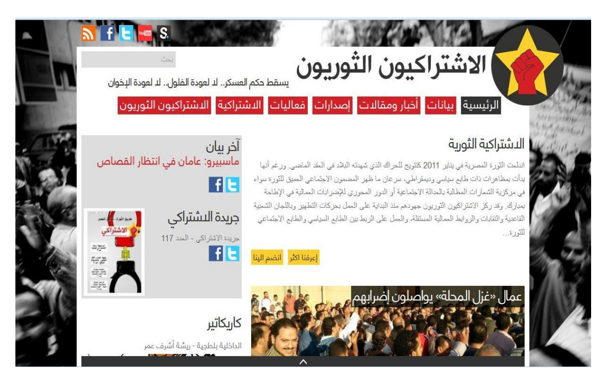
Figure 6. Front page of the beta version of the RS website, October 2013.

The turn toward images required a third change: working with and refining the use of media tools that were already in the hands of hundreds of thousands of Egyptians—in particular, camera phones. The RS media team organized training sessions for members and supporters that emphasized the use of images and video (Ibrahim, 2013). Underlying this change in practice was a political perspective elaborated by El-Hamalawy in a two-part article from 2012, which argued in favor of developing the mobile phone as a key tool for revolutionary activists in their battle with the state-run media (El-Hamalawy, 2012a, 2012b).