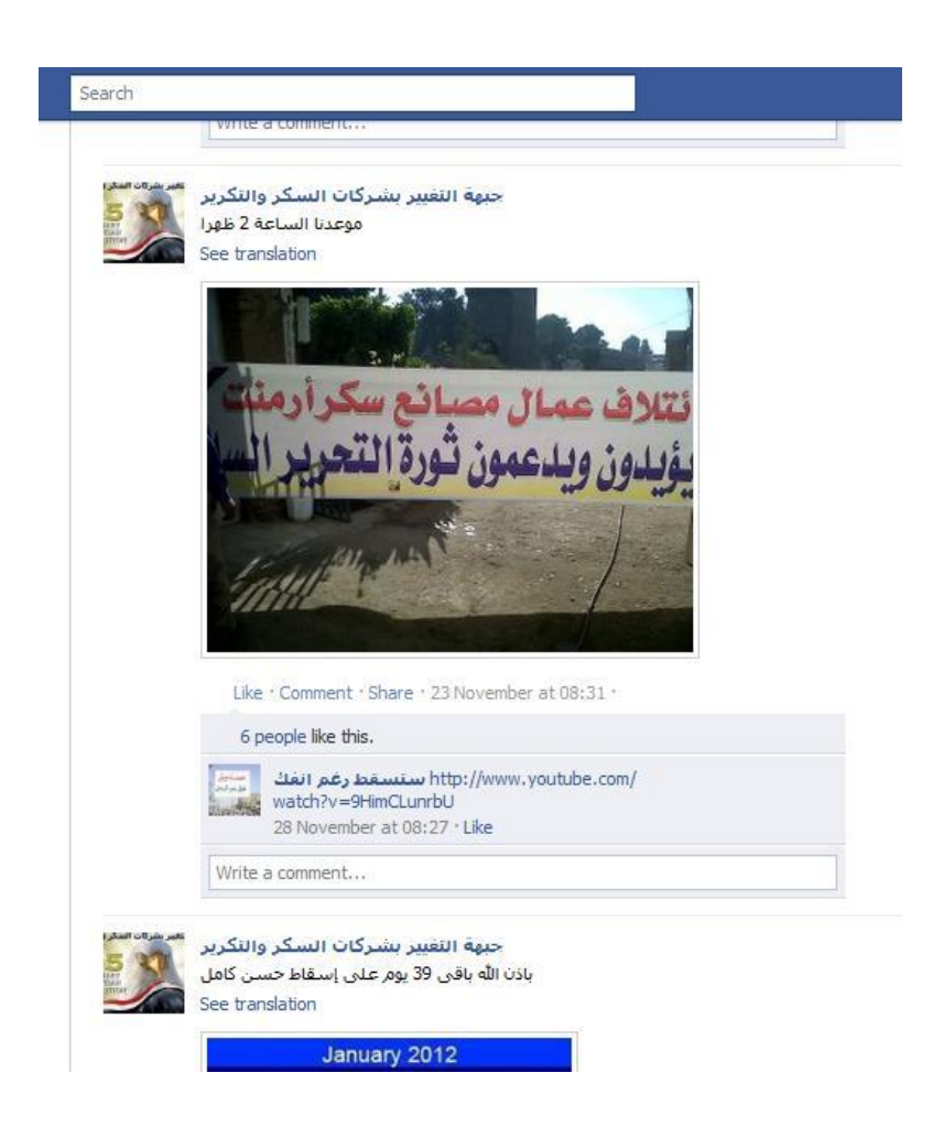
Figure 3. Screenshot from the Sugar Factories Front for Change Facebook page showing a photograph of a banner in support of the "Tahrir Revolution" at Armant Sugar Refinery, November 23, 2011.

It is important to emphasize that Facebook pages created by labor movement activists were not simply spaces in which to share content created by others; they served as platforms for the dissemination of content created by the workers concerned. This took a number of forms, including editorial comments accompanying other content or comments and statements in the voice of the group. Because most of the Facebook pages we analyzed for this article allowed either comments or postings by others on the page, battles with hostile commenters were relatively frequent.