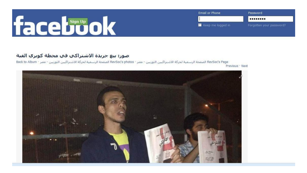
Figure 7. Photograph of activists from the Revolutionary Socialists selling their newspaper on the street in October 2013, posted on the group's Facebook page.

about it online. Selling the paper makes direct physical contact with people, and translates directly into activity. (RS member 2, personal interview in Arabic, Cairo, Egypt, November 2, 2012; see also Figure 7.)