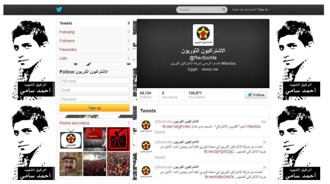
Figure 4. The RS Twitter account @RevSocMe, October 2013.

Nevertheless, the revolutionary explosion of 2011 made possible the transformation of all these publications across several dimensions. Not only could they reach much wider audiences than ever before, partly a result of the relaxation of state repression that had hampered the RS publishing activities in the prerevolutionary era, but the relationship between the different elements of what El-Hamalawy terms a "revolutionary media apparatus" could be reconfigured to meet the needs of building revolutionary organization in the digital era (Television al-Ishtaraki, 2013). This reconfiguration did not involve the abandonment of print publications; on the contrary, the RS massively expanded both the print runs and, more importantly, the distribution of its newspaper between 2011 and 2013. However, the reconfiguration did involve a shift toward a model based on the group's website rather than the printed paper as the "collective organizer" of the movement (El-Hamalawy, 2012c).