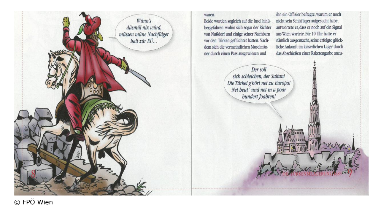
Figure 2. FPÖ comic Sagen aus Wien, pp. 8-9.

The episode featuring the siege was the most controversial part of the comic book, and it stimulated much public debate. Outcry immediately after its publication focused on the book's linking the Second Turkish Occupation of Vienna in 1683 with contemporary issues. In its campaign, the FPÖ blamed the city's crime rate on "professional gangs from Eastern Europe" and "immigrants unwilling to integrate." The comic addressed these current integration issues by placing them in the context of the historical event and concluded: "Turkey doesn't belong to Europe! Not now and not in a couple of hundred years!" (see Figure 2). Bringing the siege of Vienna to the present, the story proclaimed a new "battle for the city." In the episode, the city's mayor, Michael Häupl, (and the SPÖ) is personally attacked and held responsible for current societal problems, particularly those concerning integration. Throughout the comic book, he is depicted as a coward and opportunistic drunkard (see lower panel in Figure 1). Furthermore, the comic deals with hidden Nazi symbolism: For example, the depiction of the superhero resembling Strache is reminiscent of depictions in the anti-Semitic National Socialist paper Der Stürmer from 1935 (see, e.g., Brickner, 2010; Odehnal, 2010).