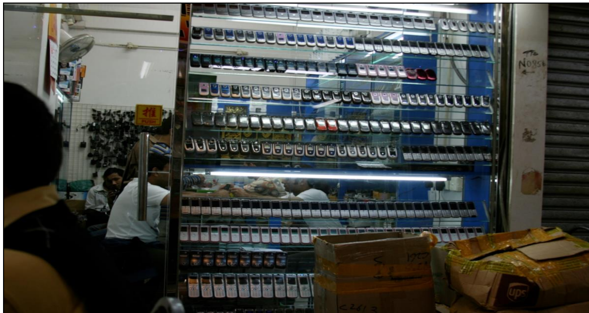
Figure 2. A whole-sale store in Chungking Mansion, Hong Kong, selling second-hand mobile phones to mostly African traders.