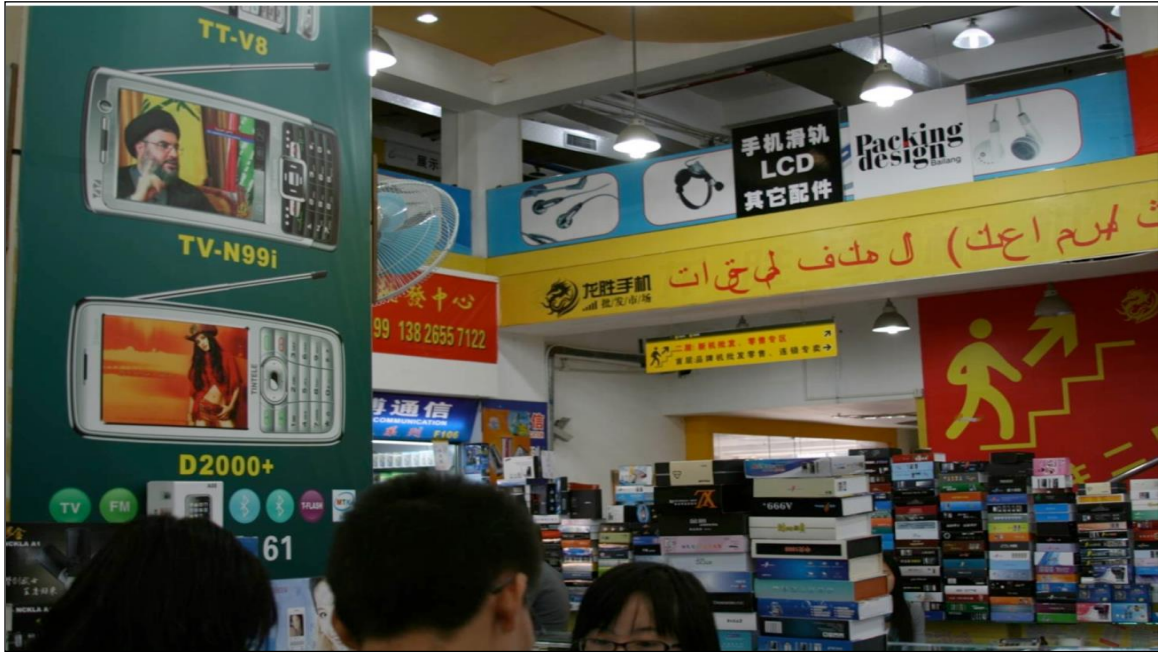
Figure 1. A store in Huaqiangbei, Shenzhen, selling Shanzhai mobile phones to traders from the Middle East.